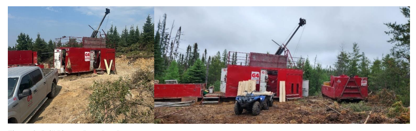
Figure 2: Drill Rigs at Root Bay Prospect area

The preliminary results received confirm the central mineralisation tenor and continued high-grades of up to 1.78% through the ore body. Drilling to date supports the current geological interpretation with some movement north and south around the flanks of the pegmatites. Further, the easterly extension of pegmatite RB-13 has increased the Root Bay trend extent another 150m to the east. Deeper drilling around the western pegmatite RB006 will also test potential depth extents around this thick and high-grade pegmatite.