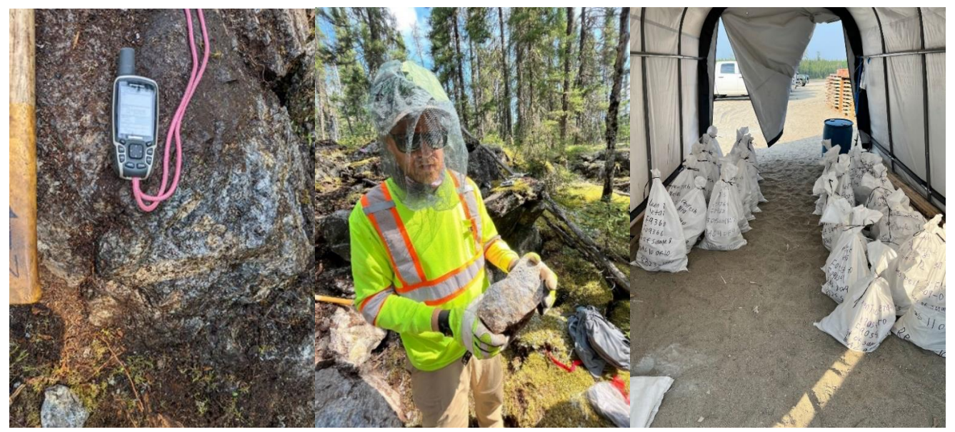
Figure 4: New spodumene discovery, Root Bay, field exploration and samples bagged and tagged.

Prospecting is continuing on areas immediate east and west of Root Bay where the thin layer of overburden allows pegmatites to be easily identified.2As announced on 26 June, the company has had immediate success with a new spodumene discovery 1.4km along strike and west of the Root Bay Deposit, extending the mineralised trend to over 2.7km. The mineralised outcrop matches the pegmatites defined at the Root Bay deposit and is likely part of a large stacked system of mineralised pegmatites. To date 29 samples have been collected with assays expected in the coming weeks.