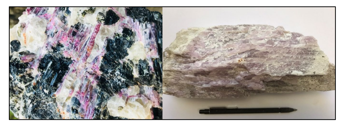
Figure 1 – Lithium bearing spodumene samples from Millie's Reward