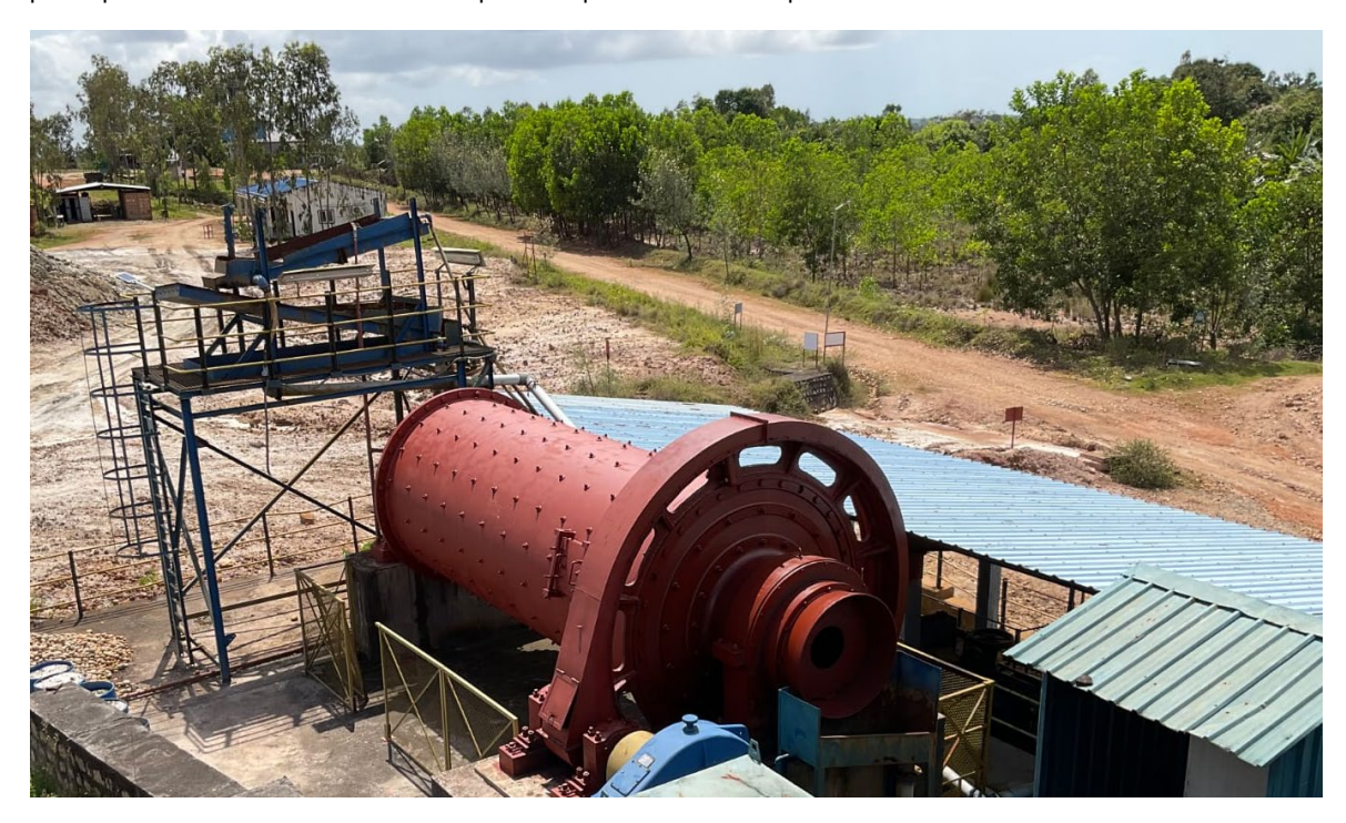
Figure 3 - Ball Mill #1 of Process Plant

The Company has had the asset on an active care and maintenance program since 2020 which has ensured that the plant and infrastructure has remained in good condition. The process plant maintenance has focused on key equipment; ball mills (See Figure 3), motors and pumps. Flotation cells will require replacement upon restart.