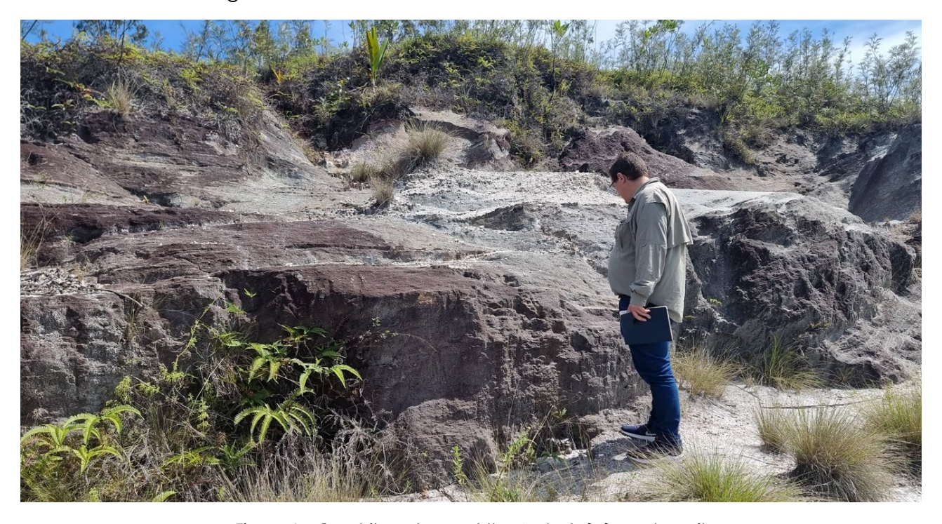
Figure 6 – Graphite outcrop at the Ambatofafana deposit

In addition to this Greenwing anticipates further drilling at Graphmada with a particular emphasis on Ambatofafana where the Company received its best results to date including a 20 – 40m zone of regolith hosted mineralisation.