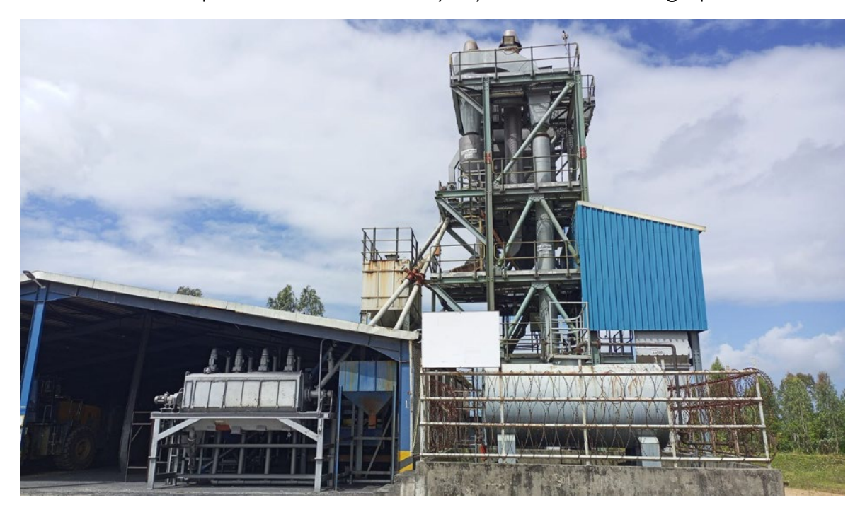
Figure 4 – Operational Flash Dryer and Screening Plant

The flash dryer and screening plant has been well maintained with the necessary items repaired to ensure Graphmada can effectively dry and screen flake graphite.