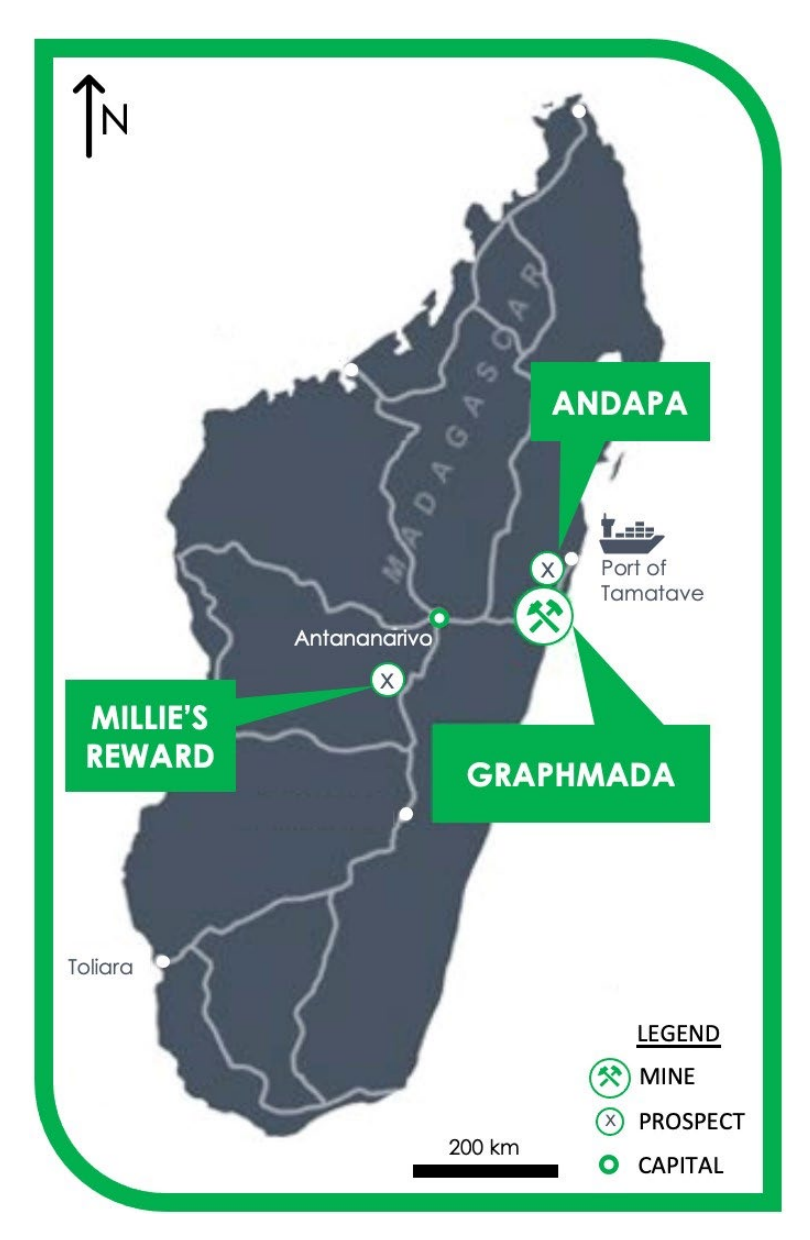
Figure 2 – locations of Greenwing's projects