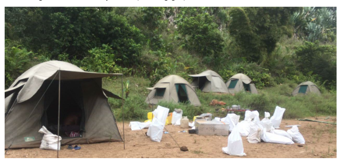
Figure 7 – Camp established at Andapa for the Auger Team

Greenwing returned to the Andapa prospect in early October 2023 and has commenced a six-month auger drilling campaign with a planned 436 auger holes. Andapa is located circa 60 km closer to the deep-water port at Tamatave than the Graphmada Mining Complex and along strike from an adjacent operating graphite mine.