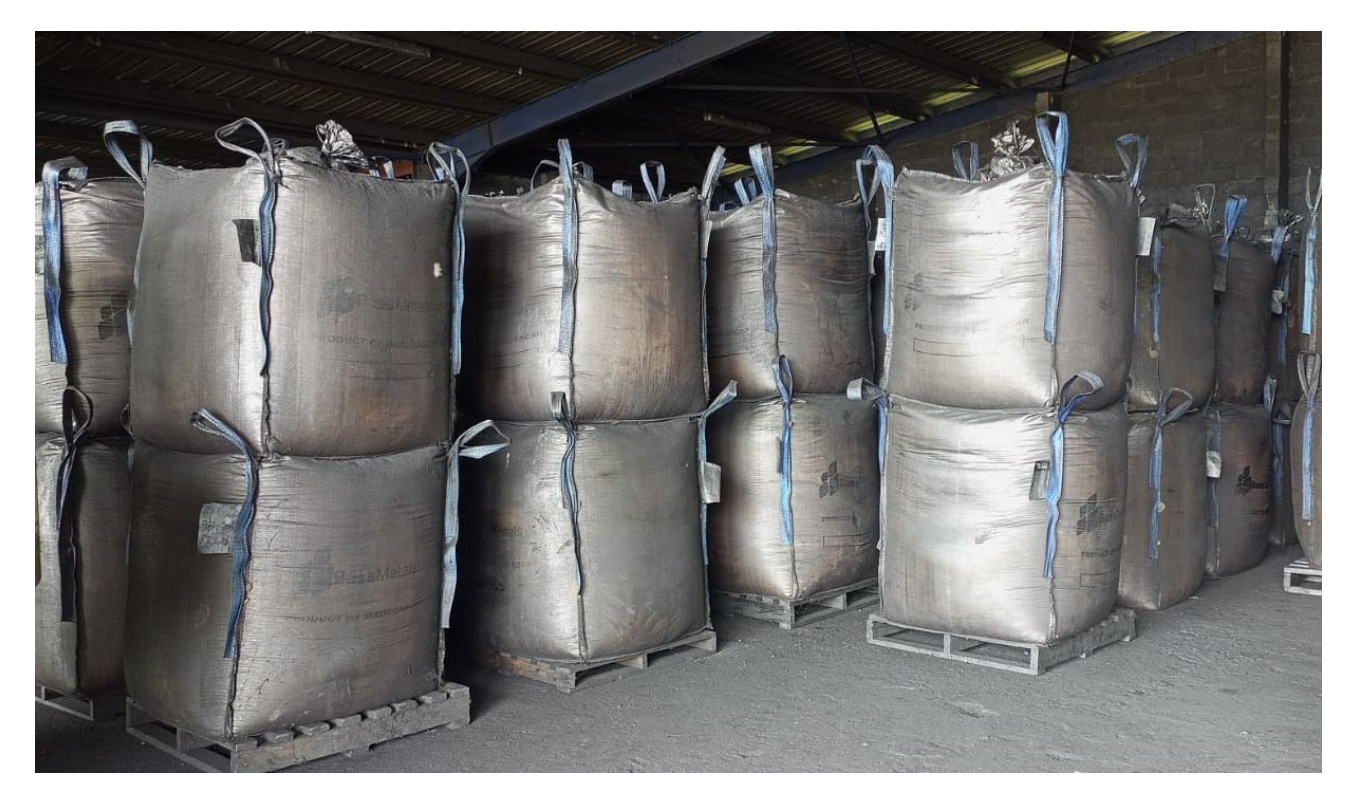
Figure 8 - Current graphite stock at Graphmada