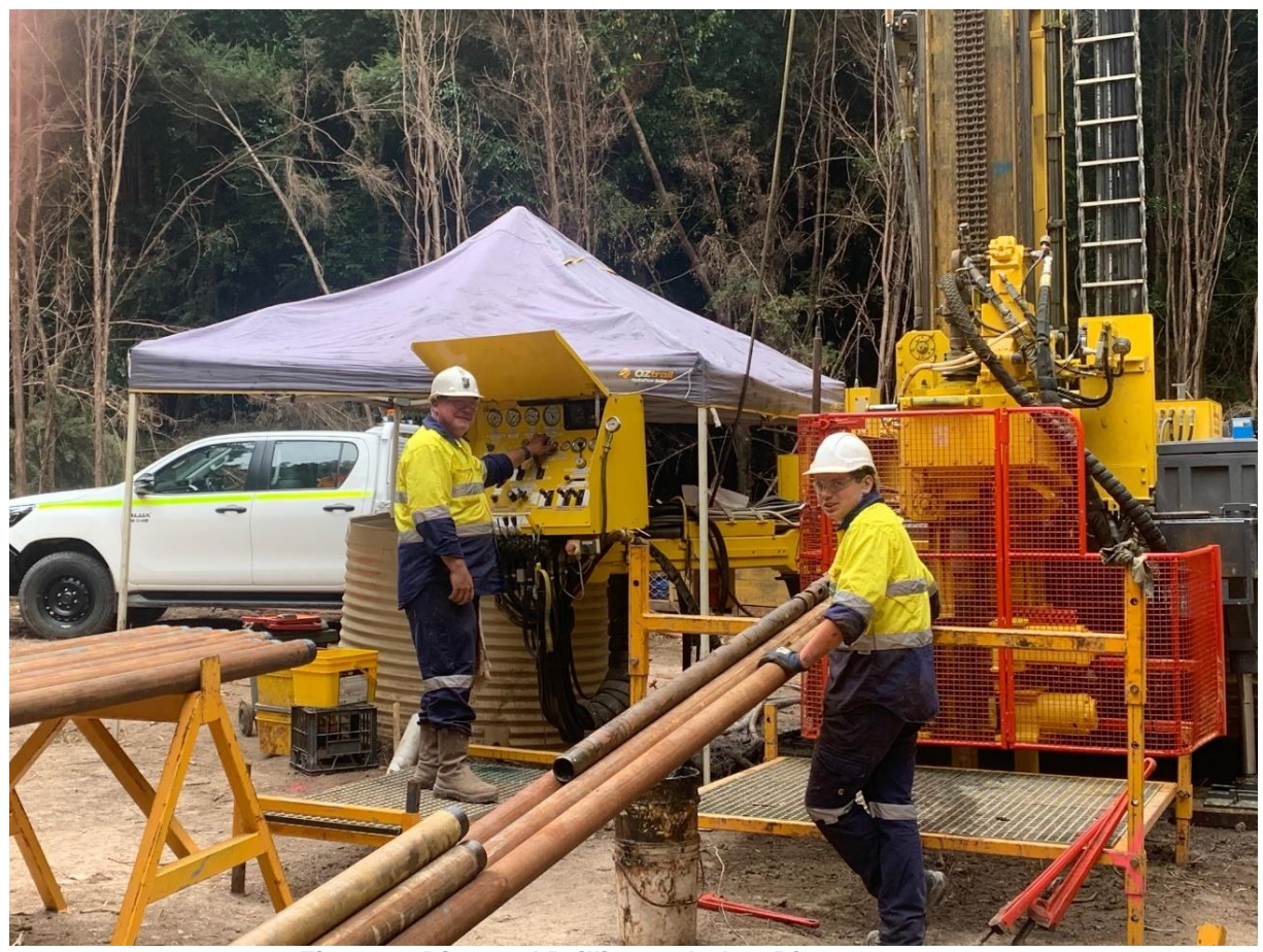
Figure 1: Diamond Drilling at Arthur River prospect

We are taking all the steps required to progress the project towards a "production ready status" and we look forward to updating the market regarding end-product magnesium market. We are assessing the opportunities to supply a low carbon, low waste, potentially "green magnesium" product to the sizeable Aerospace, Military, Automotive and Transportation sectors. GWR is close to narrowing down a processing method along with shortlisting potential nearby industrial hubs with renewable energy sources."