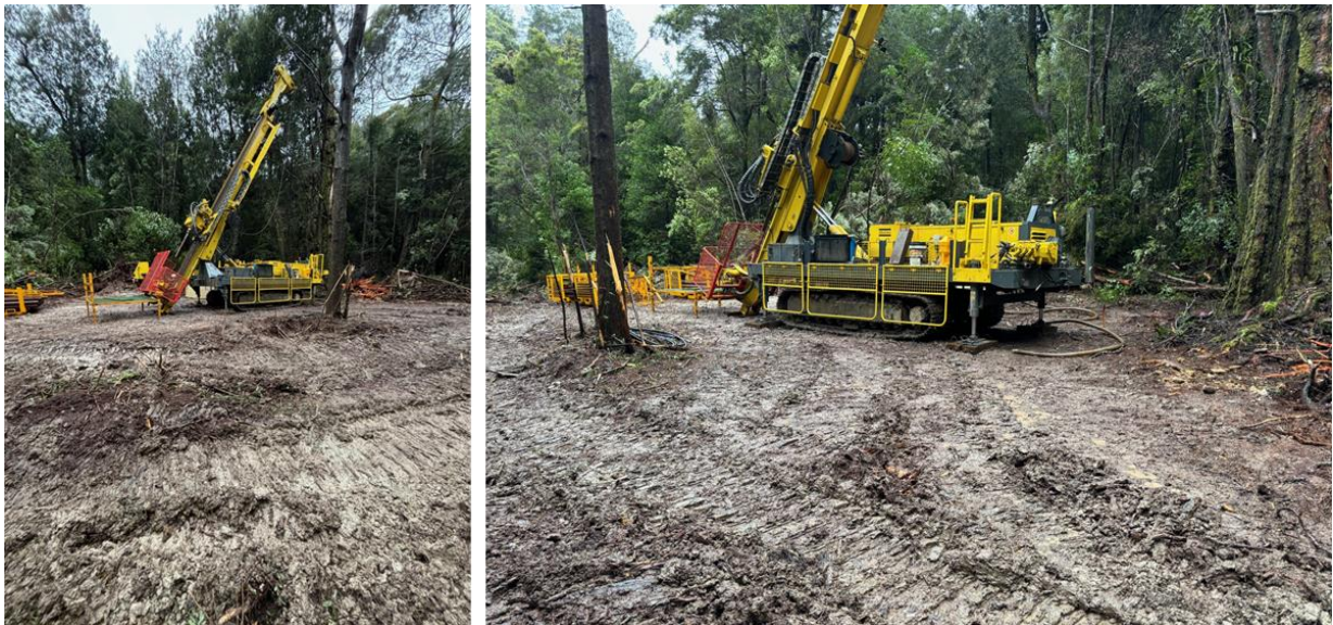
Figure 1: Phase 2 Diamond Drilling at Prospect Ridge High-Grade Magnesium Project

GWR Group Limited ( ASX:GWR ) (“ GWR ” or “the Company ”) is pleased to provide an update on the operations at the Prospect Ridge Magnesite project located in northwest Tasmania, 40 km southwest of the Port of Burnie (“Prospect Ridge Magnesite Project”). The Company holds a 70% interest in the Prospect Ridge Magnesite project, with Dynamic Metals Ltd (ASX:DYM) holding the remaining 30% interest. The Prospect Ridge Magnesite Project area sits on a granted Exploration Licence (EL5/2016), it is 11 km long and 51 km 2 in area and contains two magnesite targets, the Arthur River and Lyons River.