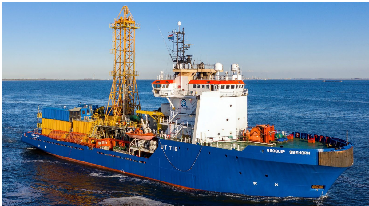
Figure 1. The Geoquip Seehorn DP2 vessel