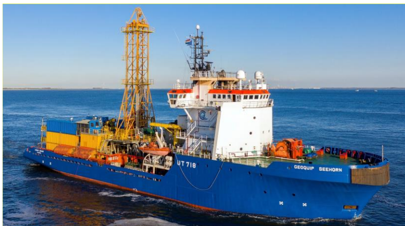
Figure 1. The Geoquip Seehorn DP2 vessel