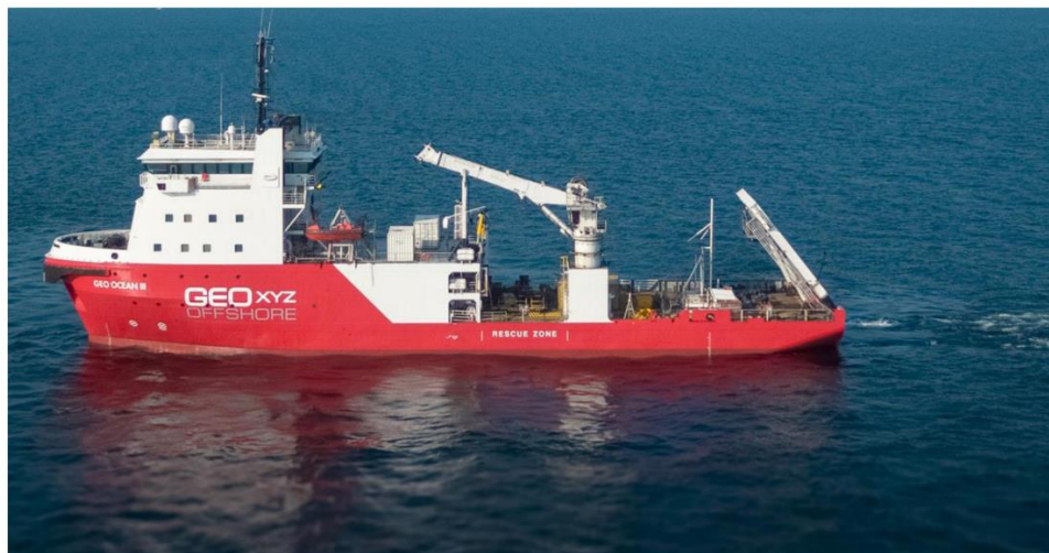
Figure 3. The Geo Ocean III with DP2 Dynamic Positioning Capability.