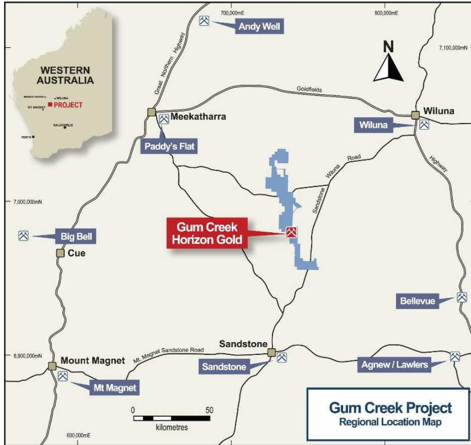
Figure 1: Project Location Plan