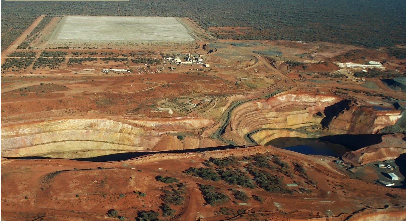
Swan and Swift Open Pit