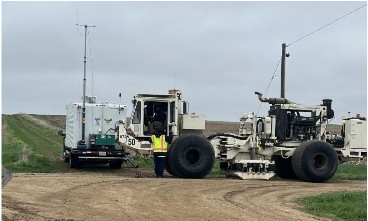
Figure 2: Paragon Geophysical Vibroseis truck on location within survey area.

The intent of the seismic survey is to support prospect analysis and drilling locations in the second half of 2025.