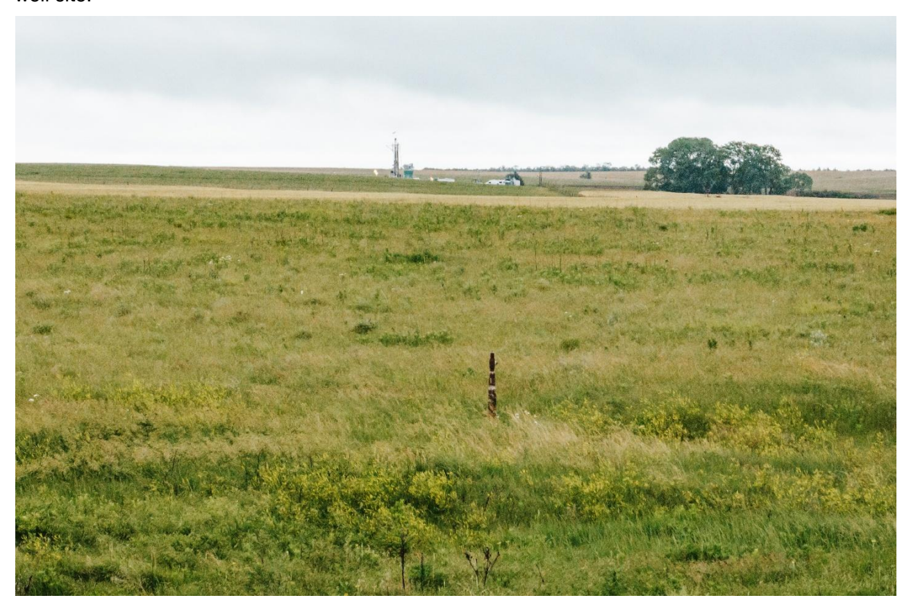
Figure 1: Blythe 13-20 (background) well site is located around 1,400m east of the historic Scott-1 well (foreground) drilled in 1982.

The Company is pleased to announce that Blythe 13-20 was drilled to a total depth of 5,300ft mDKB (1,615m) on time, on budget, with no HSE incidents. The well drilled through approximately 3,028ft (923m) of sedimentary rocks and 2,272ft (692m) of Pre-Cambrian basement. Blythe 13-20 well was drilled into a new geological play in the Company's acreage. The Blythe 13-20 well site is located around 1,400m east of the historic Scott-1 well drilled in 1982, which reported hydrogen concentrations of up to 56% in the sedimentary section<sup>1</sup>. The drilling depth reached was 3,100 ft (945m) mDKB deeper than Scott-1 well. The Company has 6,860 net acres in close vicinity to the well site.