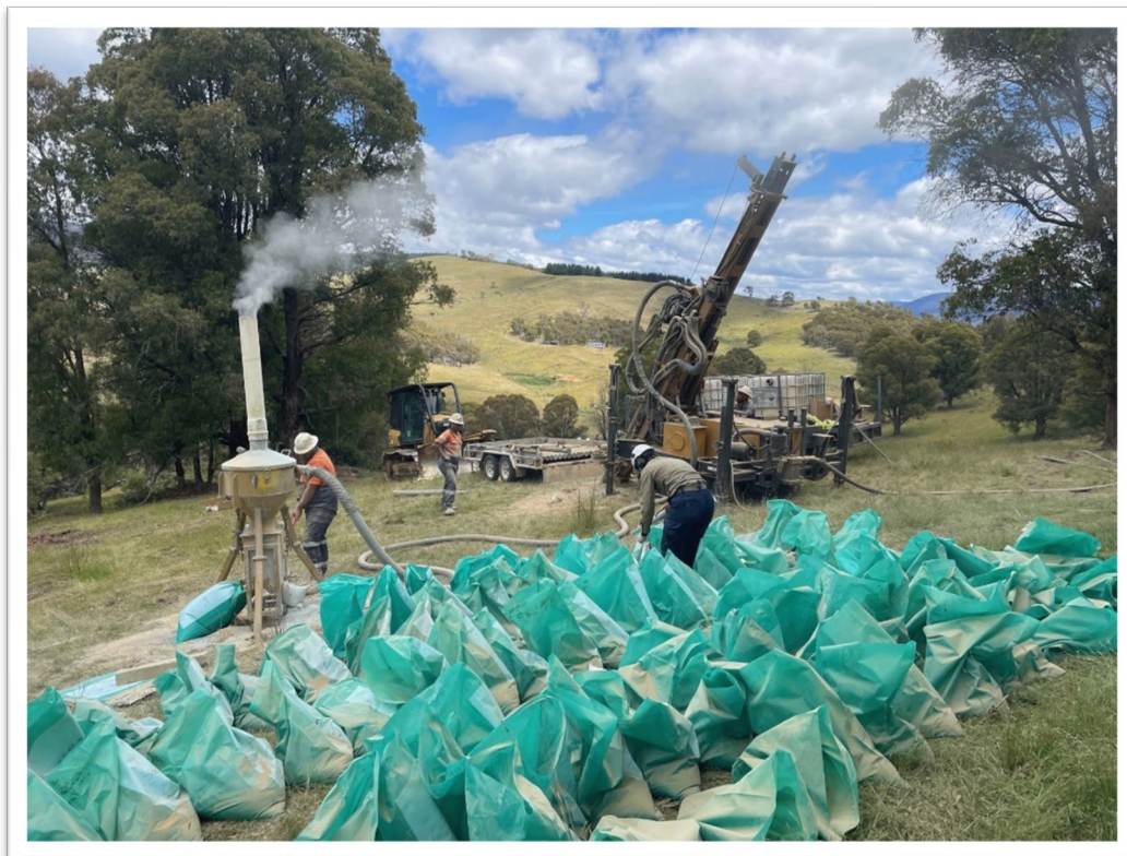
Figure 1: Reverse Circulation (RC) drilling on site at EL7073 Cobungra.

Infinity Metals Limited ('Infinity', or 'the Company') wishes to announce it has received initial composite sample assays from Reverse Circulation (RC) drilling conducted at the Comstock (CST) Prospect within its 100% owned Cobungra Project, northern Victoria (Figure 1). The full drill plan and significant assay results are in Appendix 1.