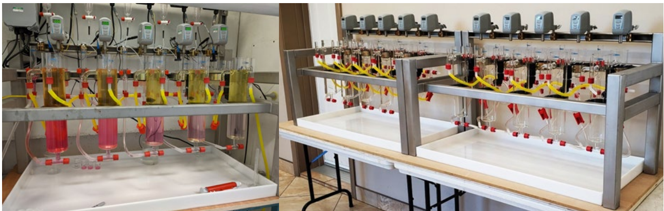
Figure 3: Mixer Settler pilot plant located at Queens University Ionic Liquids Laboratory (QUILL) at QUB.