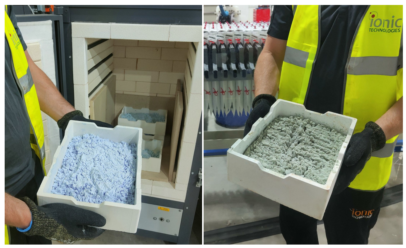
Figure 1: First separated magnet rare earth oxides produced from Ionic Technologies' Belfast Recycling Demonstration Plant, showing >99.5% Neodymium oxide (Nd<sub>2</sub>O<sub>3</sub>) on left, and Didymium oxide (NdPr oxide) on right.

"IonicRE are planning to progress the technology with the deployment of modular recycling initiatives in markets looking to develop domestic, secure, and sustainable supply chains to address strategic supply and sovereign security, placing Europe at the epicentre of rare earth element recycling".