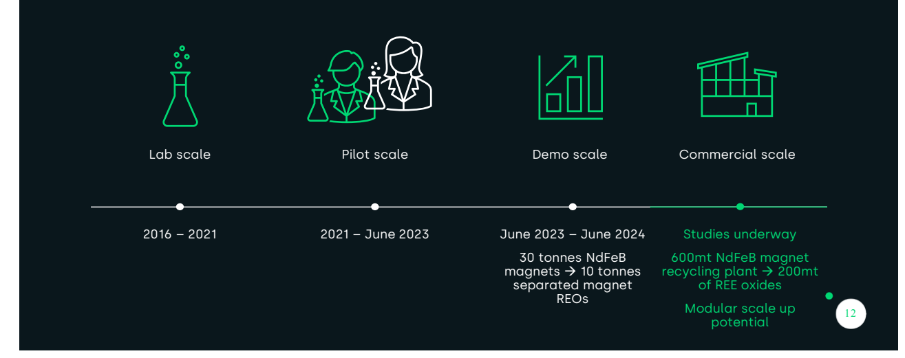
Figure 4: Ionic Technologies path to production.