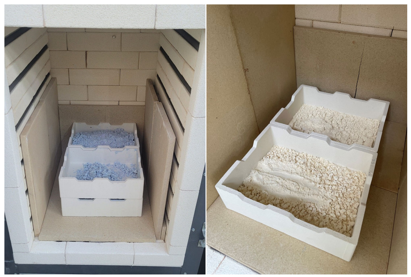
Figure 2: Calcination of Nd<sub>2</sub>O<sub>3</sub> on left, and Dy<sub>2</sub>O<sub>3</sub> oxide on right.

The process uses a hydrometallurgical process to extract the rare earth elements (REE), then separate the individual magnet REEs within – Neodymium (Nd), Praseodymium (Pr), Dysprosium (Dy) and Terbium (Tb) – and finally refine to high purity individual magnet rare earths oxides (REO).