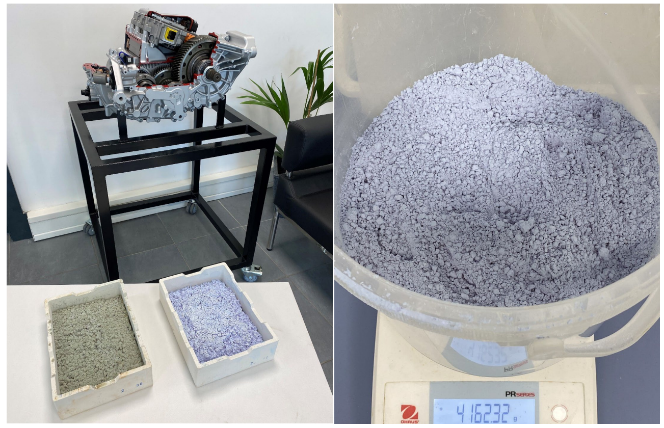
Figure 3: Left, image shows first NdPr oxide and Nd<sub>2</sub>O<sub>3</sub> product laid out in Ionic Technologies showroom in front of a permanent magnet synchronous motor (PMSM), and right, >99.5% grade Nd<sub>2</sub>O<sub>3</sub> product on right.