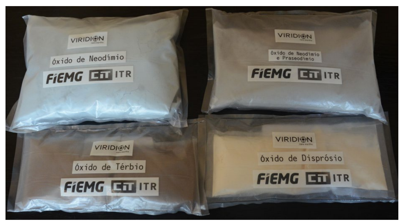
Figure 1: Recycled high-purity Nd, Pr, Dy, Tb oxides delivered to CIT SENAI ITR / FIEMG, originating from end-of-life magnets recovered in Brazil and processed at lonic Technologies' facility in Belfast, UK.

CIT SENAI ITR will use the recycled REOs delivered by Viridion for initial lab-scale experiments to evaluate if the REE oxides can be successfully transformed into alloys. Small quantities of magnets will then be produced, with the focus on assessing the quality of the magnet production specifications and verifying whether the rare earth properties meet the performance standards required for highend applications.