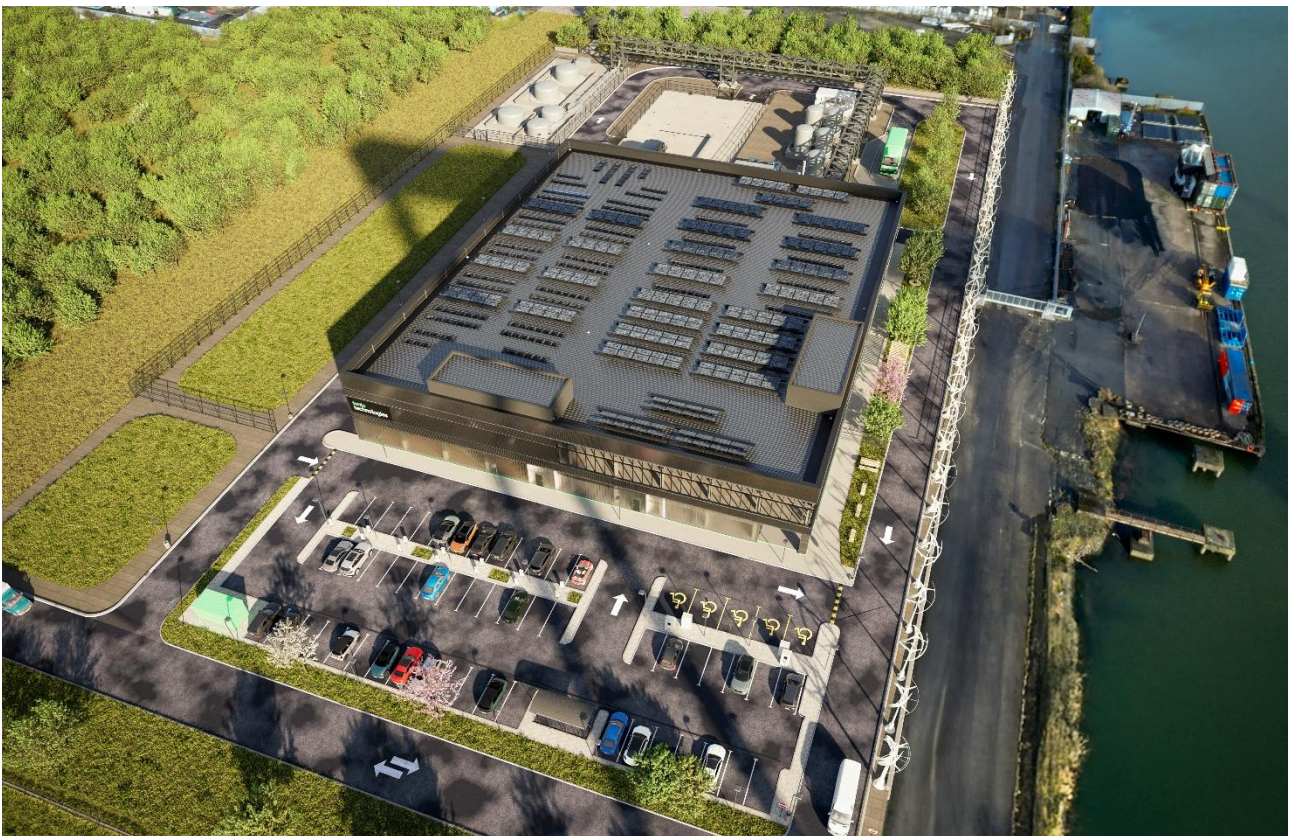
Figure 1: Render of the Belfast Commercial Plant (generated by WSP).

The plant design will represent a 40-fold increase in capacity from the 10 metric tonnes per annum Demonstration Plant capacity. There has been a dramatic escalation of magnet rare earth prices during the past year following China's export restrictions, especially ex-China prices of heavy magnet rare earths dysprosium and terbium, indicating strong upside for the commercial plant's overall economics.