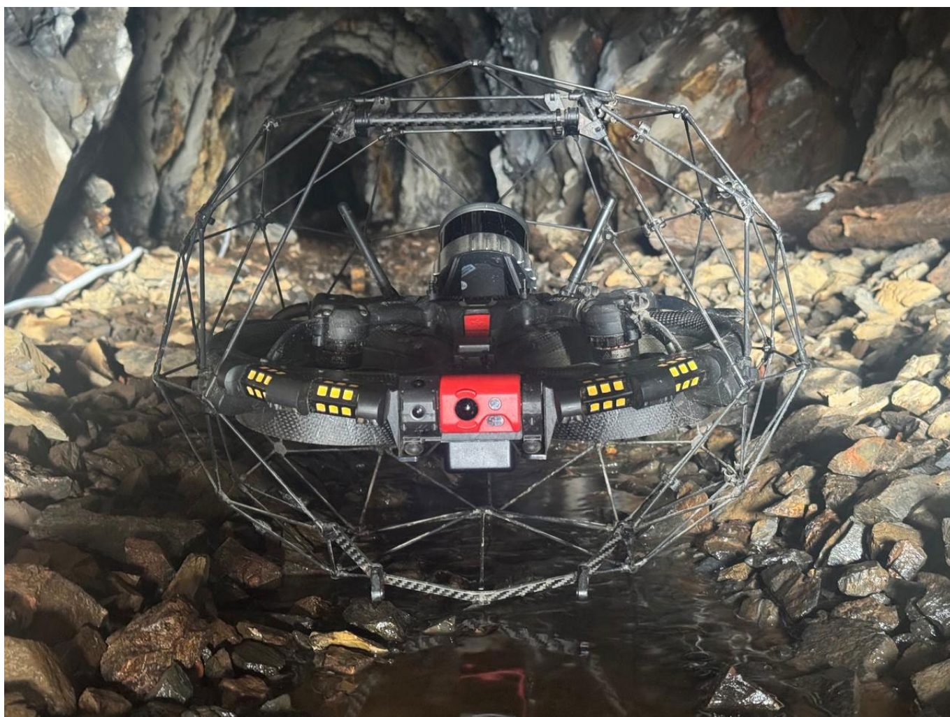
Photograph 1 Elios-3 drone setup at the adit mouth, preparing to be flown.

Krakatoa is nearing completion of the underground drone LiDAR and gas survey program within accessible historical adits at the Zopkhito Project. The pre-entry Elios-3 drone survey was designed to assist the Company by safely mapping and identifying hazardous areas, therefore opening up additional areas for future sampling which have not been accessed for decades. This work will provide visual and digital information on the condition and size of the adits, the presence of hazardous gases and in some adits, the location of historical sample points and channels.