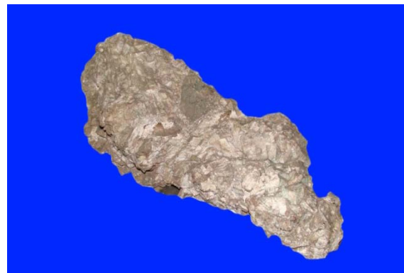
Figure 1: Giant silver nugget weighing 165kg discovered at Elizabeth Hill

In 2000, a giant silver nugget (see Figure 1 ), weighing around 165kg was discovered at the Elizabeth Hill Mine, 40 km south of Karratha at Munni Munni in the Pilbara, West Australia. The specimen is believed to be the largest primary silver mineralisation yet found in Australia.