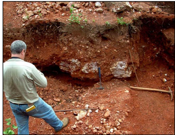
LEGEND TEAM AT ARTISANAL WORKINGS AT TAPARE