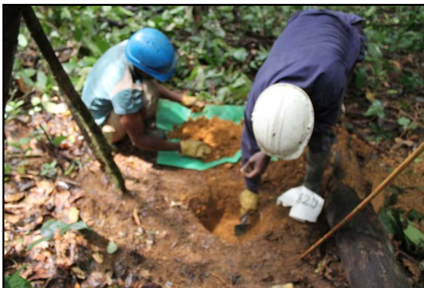
Soil Sampling at Nkoutou Prospect