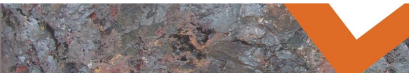
Table 1: Area D - Aircore Drillhole RKAC167 Assays