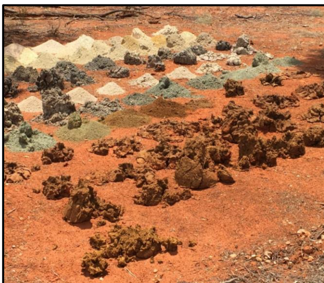
Photo 1 : Aircore Drillhole RKAC151 showing strong Fe-rich clay and goethite development between 73-111m EOH

A technical discussion of these results is provided in the body of this report.