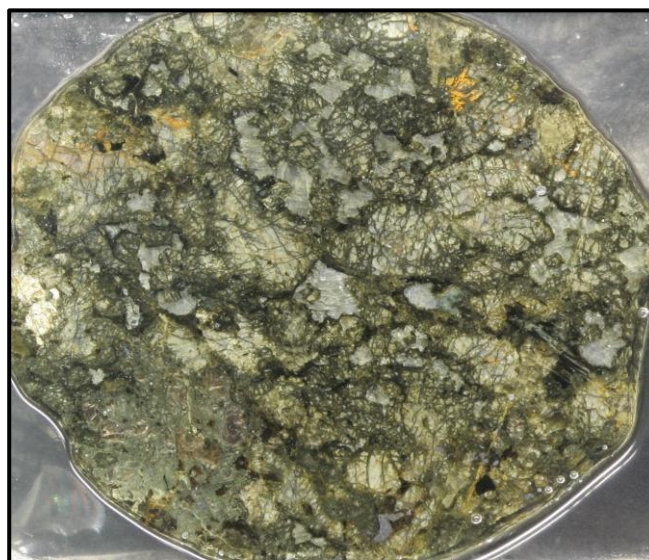
Photo 2 : Olivine Gabbronorite BOH petrology sample from RKAC151. (Photo taken prior to final thin section preparation, width 3cm).