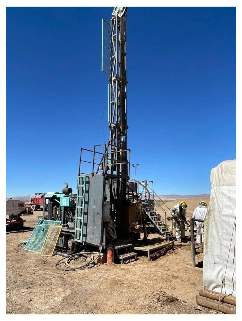
Figure 1: Diamond Drill Rig at SOZDD005, Chico VI Concession on Olaroz Salar

The objective of the initial 10 hole, 5,000 metre drilling program is to define a significant maiden JORC Resource of Lithium at Solaroz. The Company notes that it has recently appointed consulting group Hatch to undertake a Scoping Study for the production of battery grade lithium carbonate from the lithium rich brines at Solaroz, with the results of the Scoping Study scheduled to coincide with the definition of the Company's maiden JORC Mineral Resource at Solaroz.<sup>3</sup>