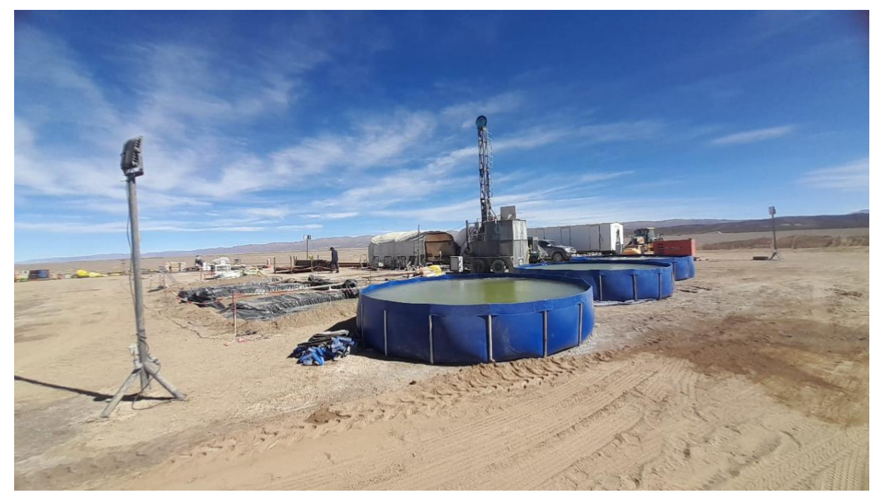
Figure 1: Diamond Drill Rig at SOZDD0007, Payo 1 Concession on Olaroz Salar