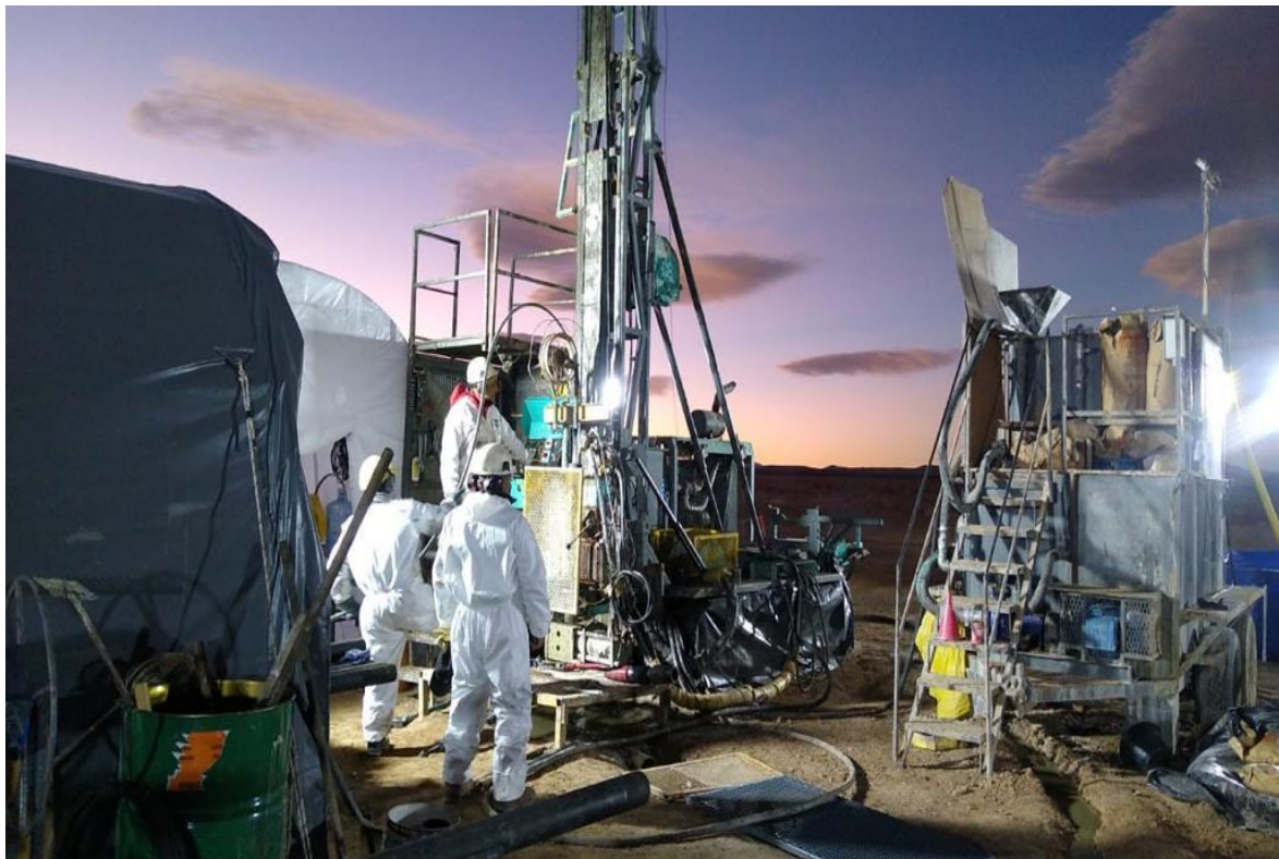
Figure 1: Diamond Drill Rig at SOZDD006, Chico VI Concession on Olaroz Salar