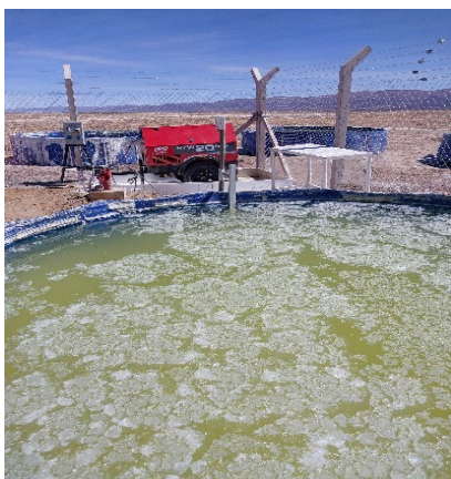
Figure 5: Site Evaporation Pond (23 September 2023)

Post completions of the on-site works, the ponds have been emptied and cleaned and will be refilled to continue further evaporation test work during the coming months to assess the seasonal differences that can be expected on the Olaroz Salar.