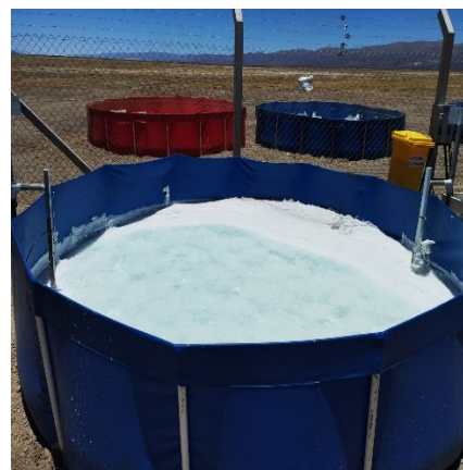
Figure 7: Site Evaporation Ponds (27 December 2023)