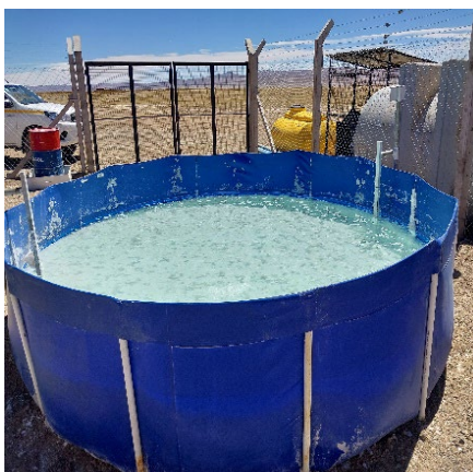
Figure 6: Site Evaporation Ponds (9 November 2023)