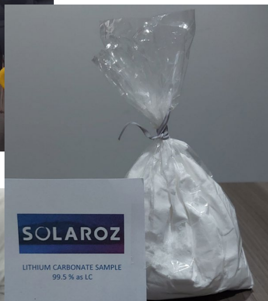
Figure 4: Final Battery Grade 99.5% Lithium Carbonate produced from the Solaroz Brine