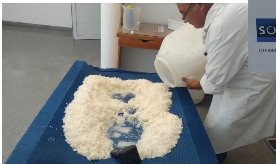
Figure 3: Salt Precipitation Stage, with concentrated brine separated from Salts