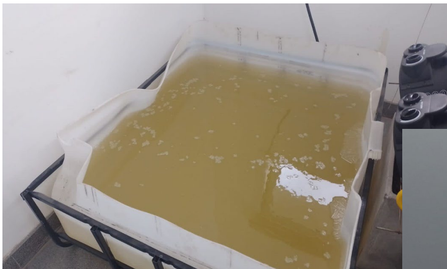
Figure 2: Primary Evaporation Stage of Solaroz Brines

Figures 2, 3 and 4 below outline the basic steps undertaken in the programme to produce the Solaroz Battery Grade Lithium Carbonate.