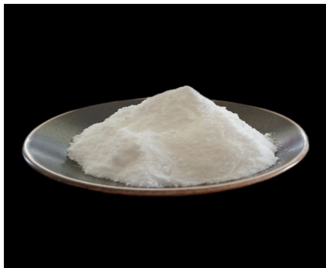
Figure 1: Solaroz Battery Grade Lithium

The production of battery grade lithium carbonate is a highly important step in the advancement of Solaroz to production with work conducted to date providing the key design criteria inputs for the advancement of the project.