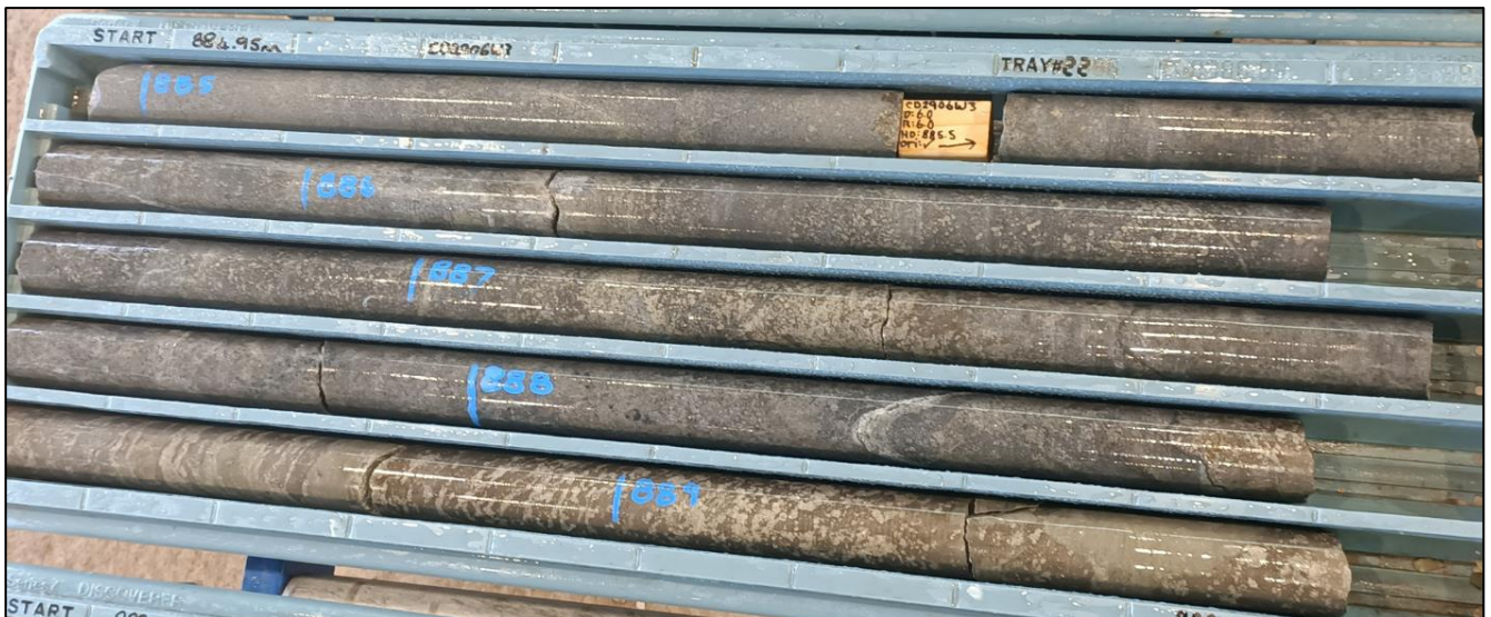
Figure 1: 884.95m to 889.40m in CD2906W3 – see Annexure 2 for full intercept details.

CD2906W3 is the final hole in a program designed to collect core for metallurgical test work at Foster South, a high-grade deposit at the Foster-Baker project ( FBA ), part of the Company's Kambalda Nickel Project ( KNP ).