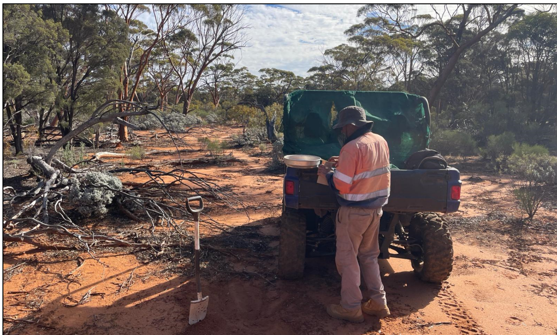
Figure 1 - Soil sampling program at the Jingjing Project.