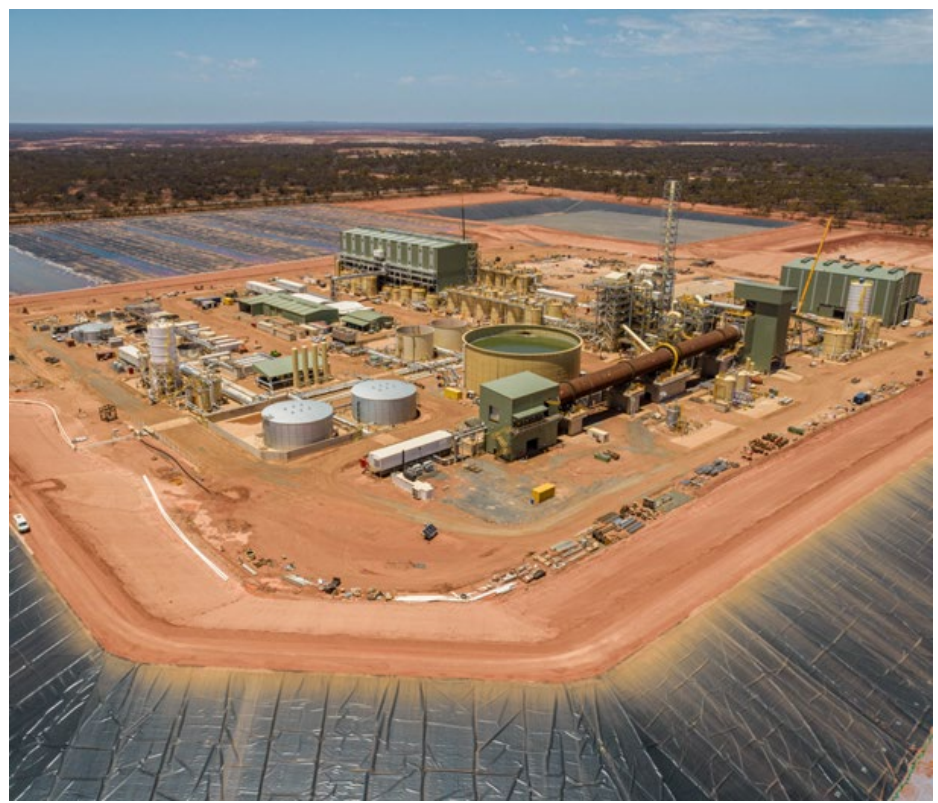
Lynas Kalgoorlie Rare Earths Processing Facility

On 12 July 2024, Lynas provided an update on acid supply arrangement for Kalgoorlie following the announcement by BHP on 11 July 2024 that BHP's Western Australia Nickel operations will be temporarily suspended from October 2024. Lynas has a contract with BHP Nickel West for the supply of Sulphuric Acid to the Kalgoorlie Rare Earth Facility from either the Kalgoorlie nickel smelter or imported sources. BHP's ability to supply acid from the Kalgoorlie nickel smelter will be affected by BHP's announcement and in line with the terms of the supply contract, BHP has affirmed its commitment to using reasonable efforts to supply imported acid to Lynas. Lynas and BHP have been working together on contingencies for continued acid supply to Kalgoorlie and these plans will now be finalised for implementation.