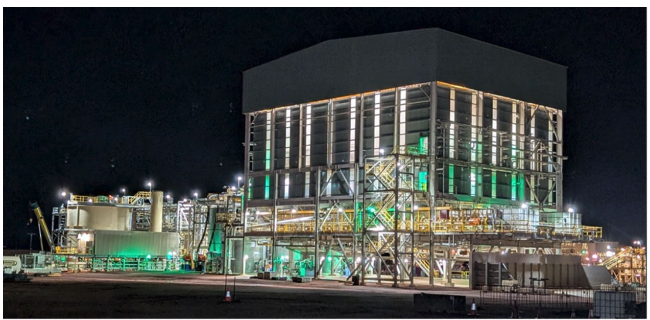
Mt Weld Expansion - Stage 1 (Concentrate Dewatering) Energisation

As announced on 22 July 2024, Lynas has signed contracts with Zenith Energy for the supply of power from a gas-firmed hybrid renewable power station at Mt Weld. The hybrid power station has been designed to deliver up to approximately 70% average annual renewable energy as well as reliable baseload thermal capability. Early works are in progress following an early works agreement signed in CY23.