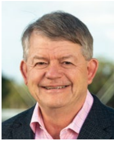
John Humphrey Chair