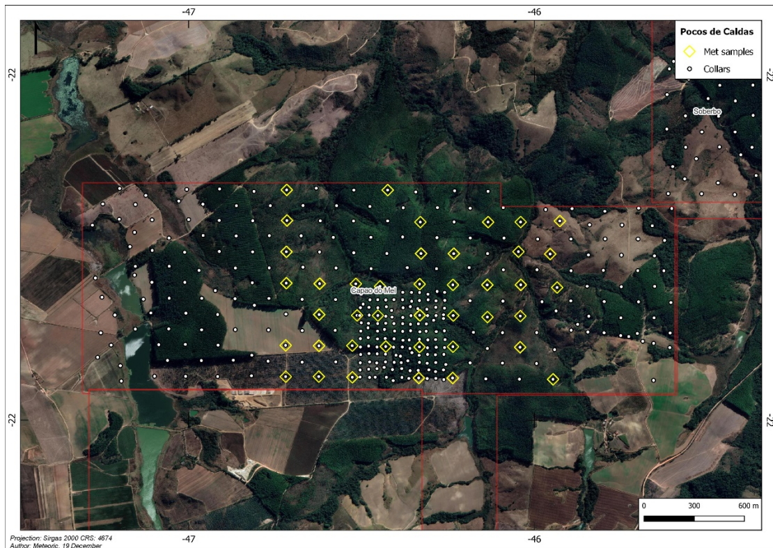
Figure 3. Location plan of drill holes from the Capão do Mel prospect (holes used for the composite sample for preliminary Metallurgical testwork shown as yellow diamonds).