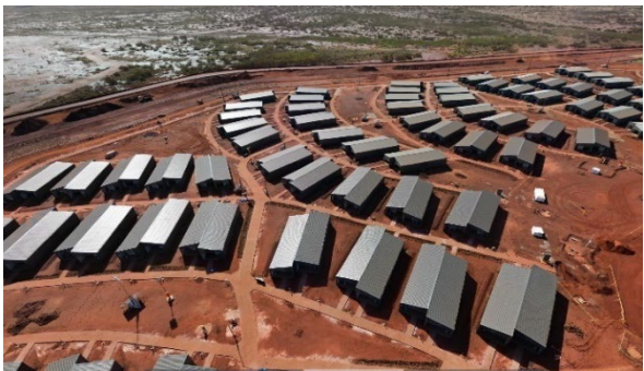
500 resort-style rooms installed at Ken's Bore