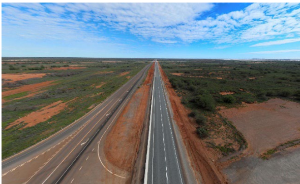
Sealing of dedicated haul road is progressing