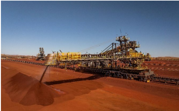
Stacker in operation at Ken's Bore