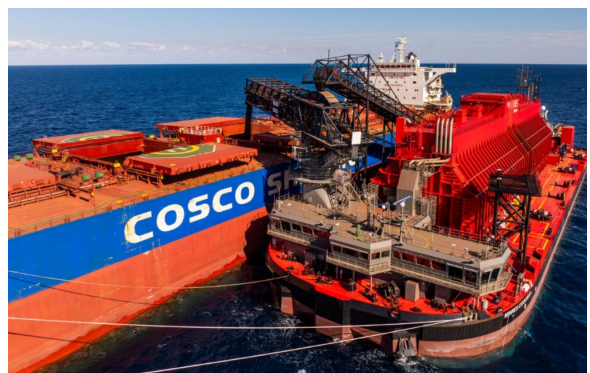
Transhipper discharging ore to minicape vessel