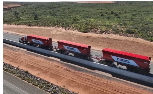
Road trains operating on dedicated haul road