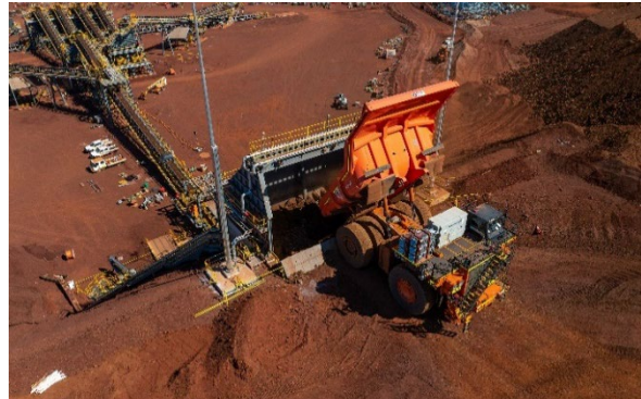
NextGen crusher in operation at Ken's Bore