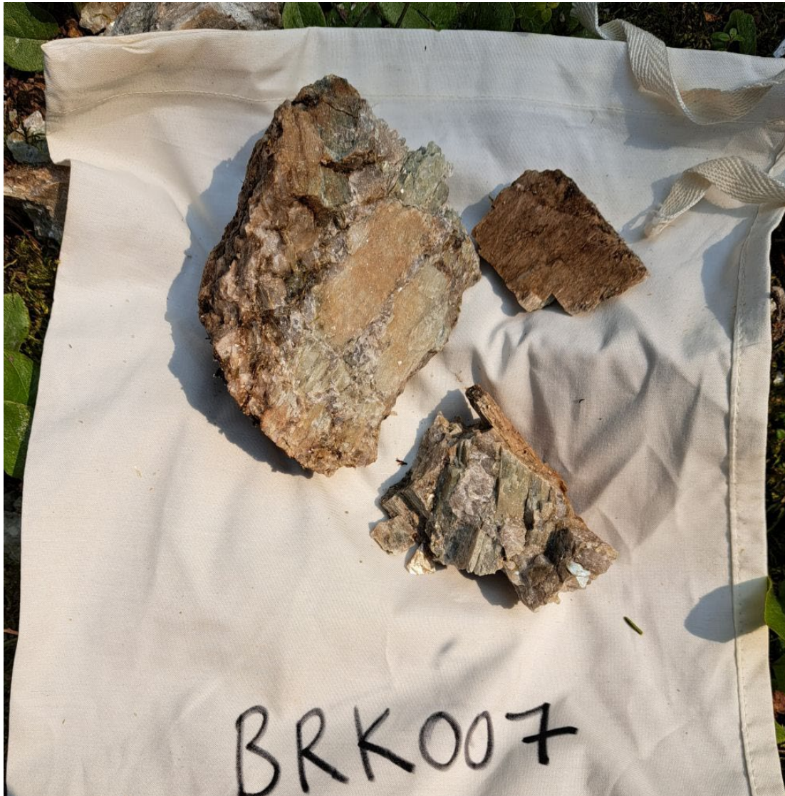
Figure 2: Detrital Pegmatite with Abundant (20% - 30%) Pale Green Spodumene – Barbara Lake

Midas' limited prospecting to date has resulted in the discovery of detrital spodumene-bearing pegmatite (Figure 2), despite areas of snow cover at the time. Seven samples are pending analysis with results expected in Q3 CY2023, and further mapping will be undertaken following receipt of the results of a recently completed LiDAR survey and high-resolution photography.