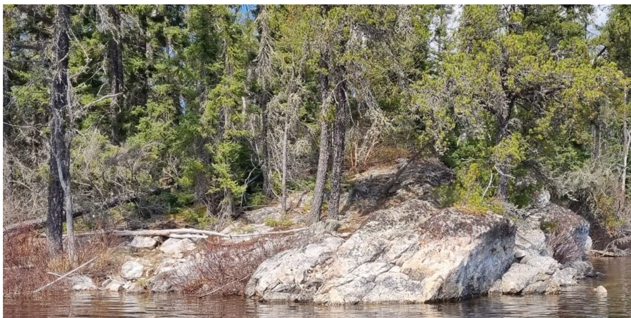
Figure 1: Outcrop of 15m wide Spodumene Pegmatite – Greenbush Project