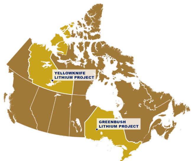
Midas Minerals Canadian Projects Location Map

Newington Lithium-Gold Project: 316km 2 of tenements located at the north end of the Southern Cross and Westonia greenstone belts, prospective for lithium and gold. Exploration in 2022 has outlined anomalous lithium and LCT indicator elements over at least 20km strike. Initial drilling intercepted pegmatites that are laterally extensive, wide and gently dipping. The project also has a number of gold targets and includes significant prior drill intercepts that justify follow-up exploration.