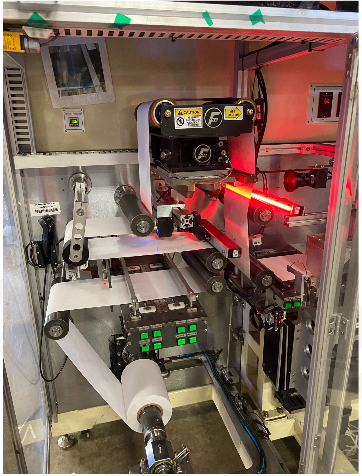
Figures 2 and 3: Stamper machine located in iM3NY Plant