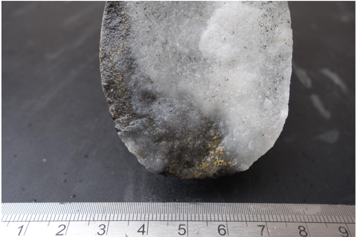
Figure 1: Visible gold is preserved as upto ~1cm sized aggregates made up of many less than 0.5mm grains within a ~1cm thick, translucent-white, drusy quartz veinlet at ~127.55m in UGA-52.