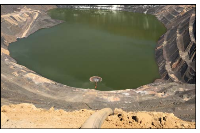
Figures 12 & 13: Installation and commissioning of the Tailings Deposition Line into the historical open pit

Office Level 4, 360 Collins Street, Melbourne VIC 3000