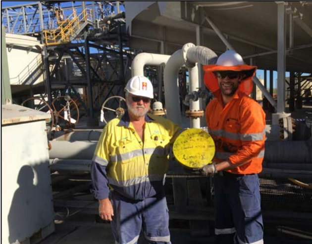
Figures 14 & 15: Loading of the cleaning pigs into the Concentrate Slurry Pipeline at the Lawn Hill Mine site (left) & receival of the second cleaning pig at the Karumba Port Facility (right)