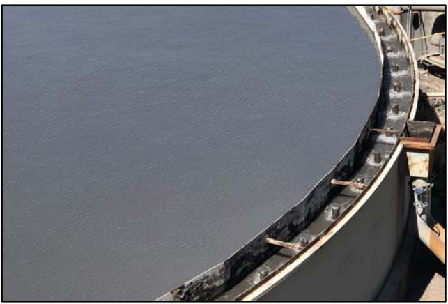
Figures 8 & 9: Water exiting the final conc. float cells (left) & zinc thickener commissioned for operations (right)