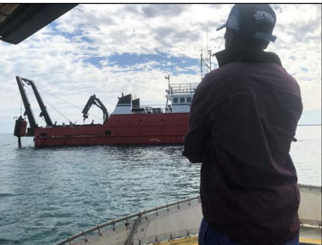
Figures 18 & 19: New Century staff and Cultural Heritage Monitors of the Kaialdit People (Traditional Owners) inspecting the cyclone mooring buoy removal process