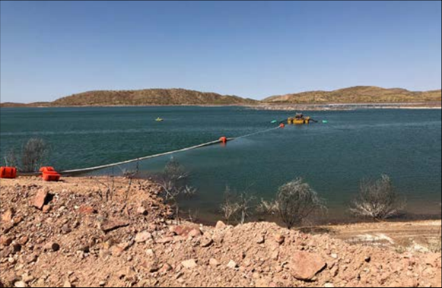
Figures 4 & 5: Slurry Winning Pontoon installation (left) & Water Winning Pontoon on the Evap. Dam (right)