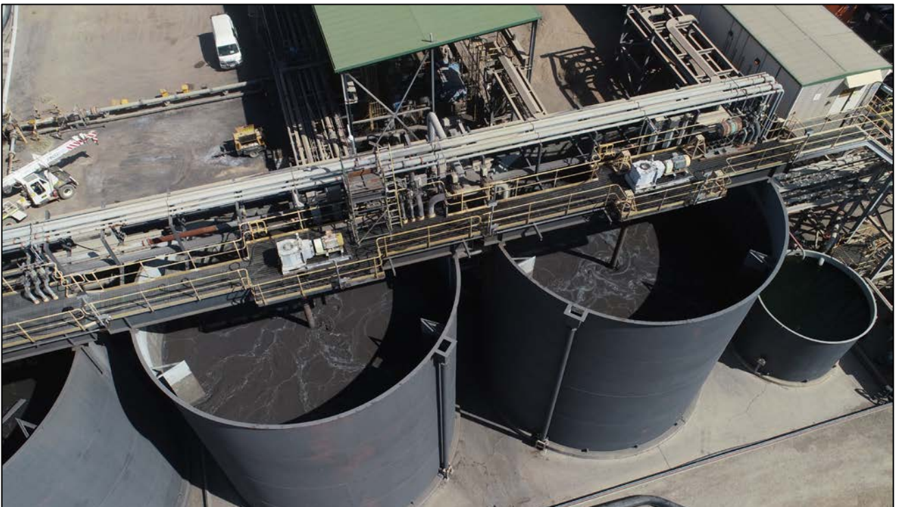
Figure 3: Part of the onsite concentrate inventory held in the product tanks and now being pumped to the Karumba Port Facility via the slurry pipeline