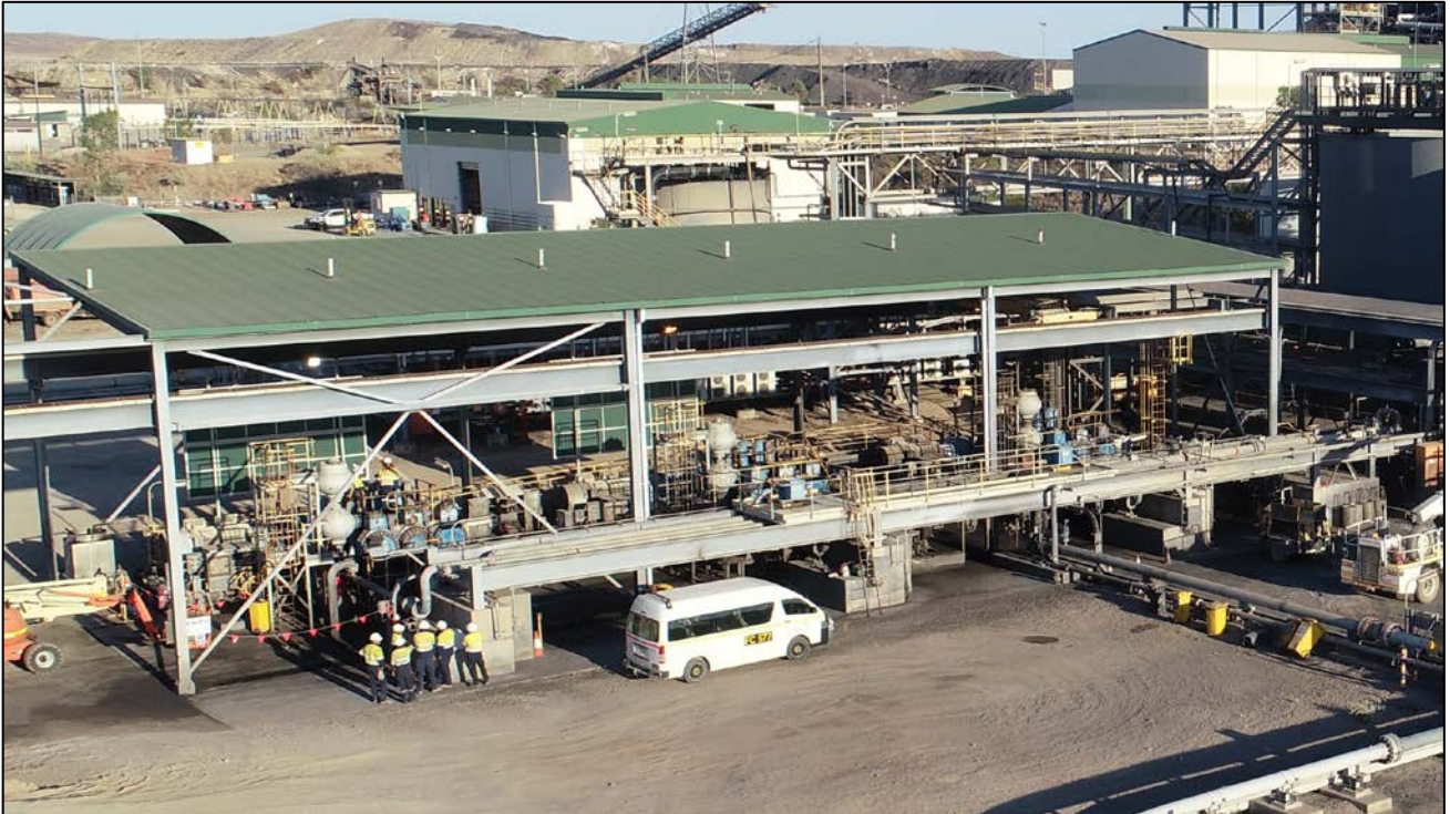
Figure 2: Three Wirth pumps used for single stage pumping (duty/duty/standby) of concentrate along the 304km slurry pipeline