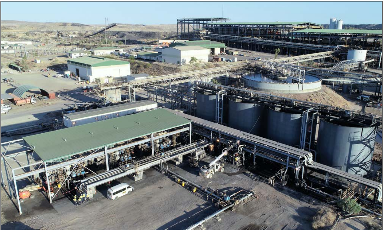
Figure 1: Century Zinc Mine slurry pipeline inlet, with product tanks and zinc product thickener (foreground) along with stores, maintenance and the processing plant (background)

The pumping of slurry to Karumba also allows the Company to anticipate the receipt of first revenue from sales of concentrate later this month.