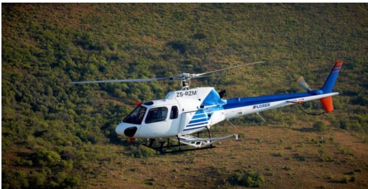
Figure 2: NRG owned AS350-B3 (Squirrel) helicopter