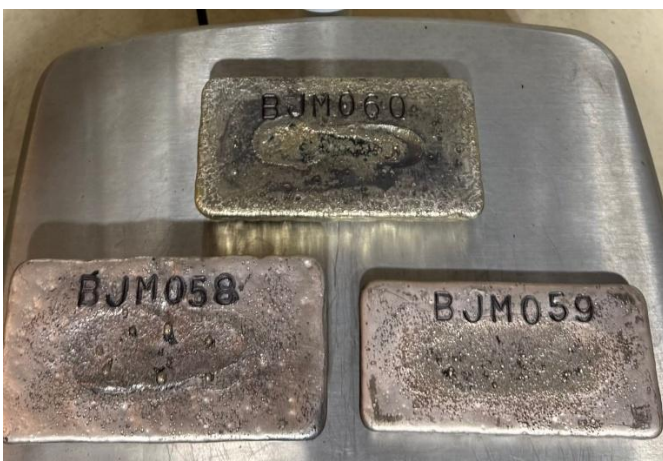
Figure 1: Total doré smelt weight of approximately 344 ounces produced from the 24 May 2026 smelt campaign comprising doré bars BJM058 to BJM060.

Native Mineral Resources Holdings Limited (ASX: NMR) (“Native Mineral Resources” or the “Company”) is pleased to provide an operational, metallurgical and strategic growth update for its Blackjack Gold Operations and broader Charters Towers project portfolio in Queensland.