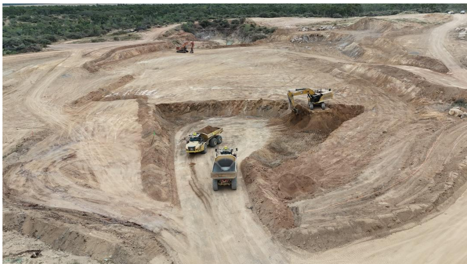
Figure 3: Active mining and waste stripping activities underway at the Blackjack Mid Pit during May 2026.

The Mid Pit mining program currently includes 14 planned blasts covering approximately 739kt of material, with mining activities expected to continue through to the end of 2026. At the Blackjack North Pit, additional drilling is required to further refine the geological model. RC drilling activities are planned following completion of the Far Fanning RC drilling campaign in August 2026, with mining activities currently scheduled between Q1 and Q3 2027.