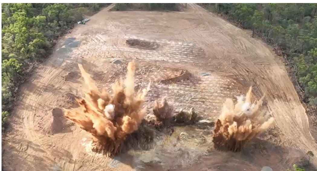
Figure 7: Initial blast completed at Podosky ML10315 on 19 May 2026 targeting approximately 47kt of mineralised material.