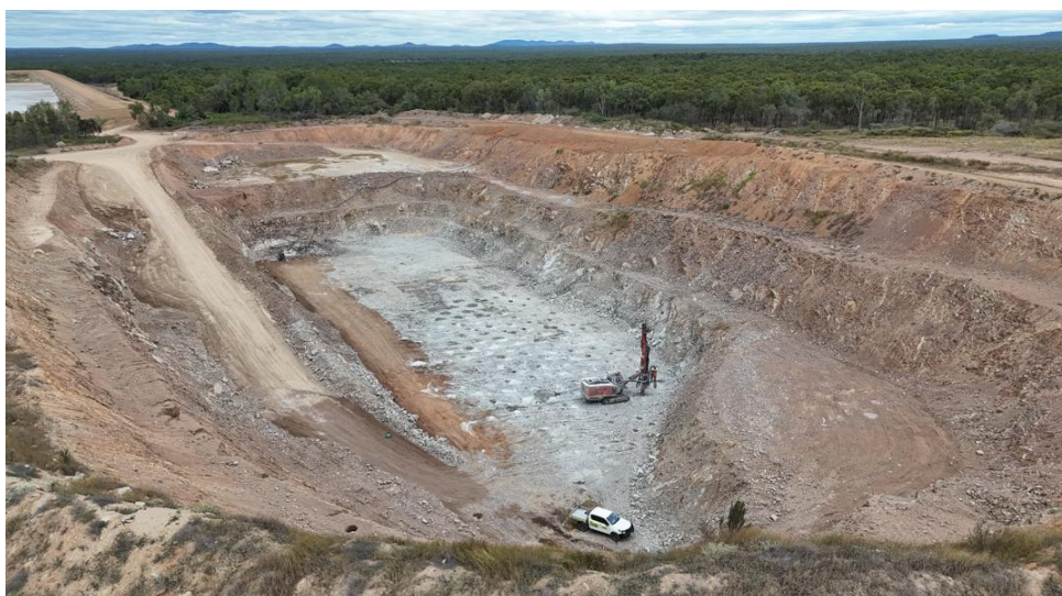
Figure 4: Drill and blast sampling activities progressing at the Blackjack South Pit as part of ongoing mining development and grade control programs.