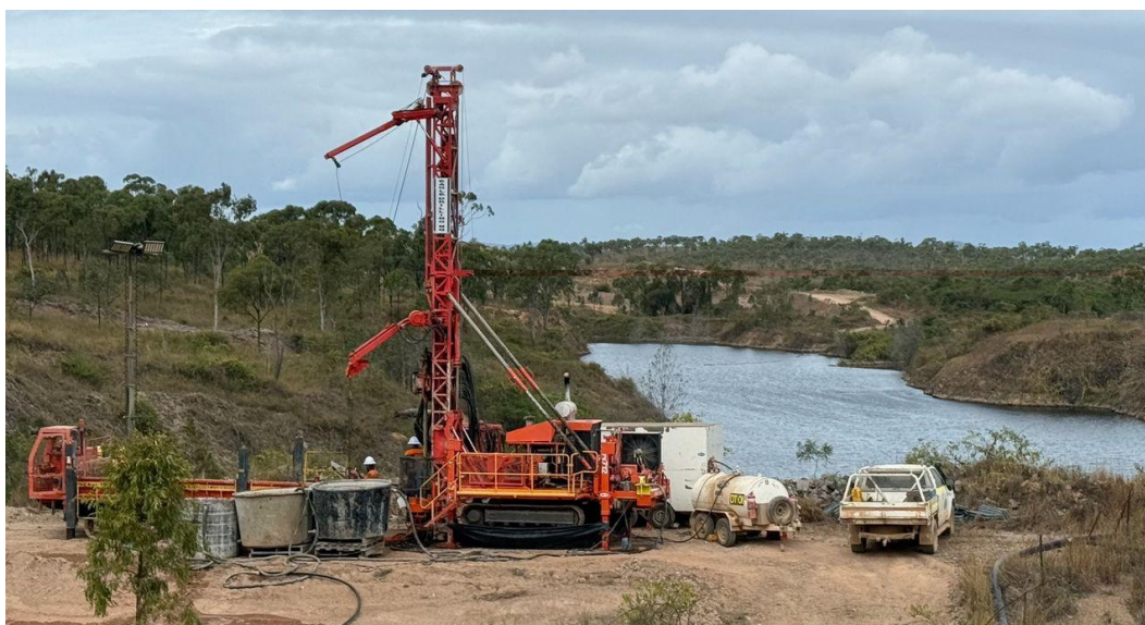
Figure 5: Diamond drilling activities at the Far Fanning Project in early May 2026.

Far Fanning remains on track for mining commencement in Q3 2027 following completion of dewatering activities.