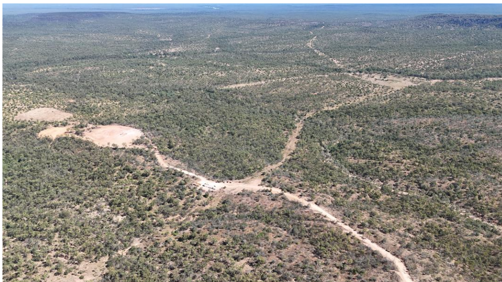
Figure 6: Aerial view of the Podosky Project showing mining preparation and site establishment activities completed during May 2026.

Mining activities are expected to continue through to December 2026 based on an average mining schedule of approximately 20 mining days per month.