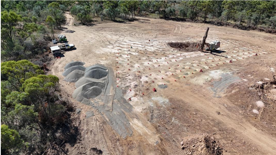
Figure 8: 277.5-004 Drill & Blast activities ongoing as part of second blast scheduled later in the month.