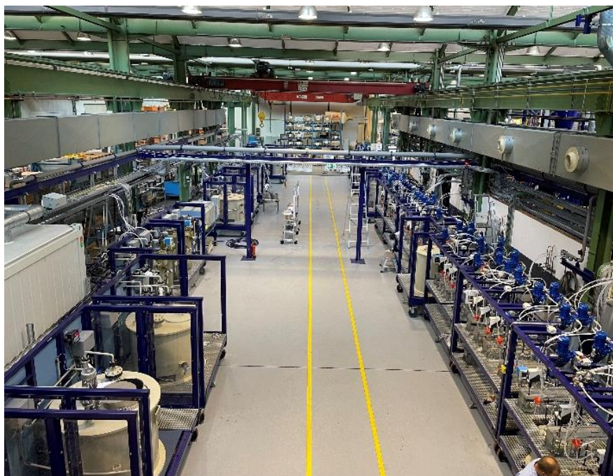
Figure 1 – Primobius DP Stage 2 Refinery Circuit

The integrated DP trials are expected to commence in October 2021 with completion by the end of November 2021. Thereafter, the DP will be modified, and sections moved to meet the requirements of the 10tpd Shredder Plant which is due to offer commercial LIB recycling services in Q1 2022 (for further details see Neometals announcement titled “Battery Recycling - Decision to fund commercial operations” dated 19 th August 2021).