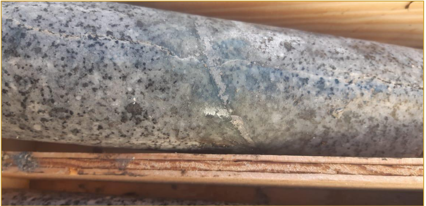
Hole ID: KBHD-049 (Core at 251m) Photo A: Quartz-Arsenopyrite veining in uncut core