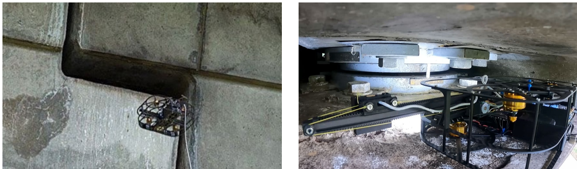
Figure 4: showcasing METRON in live deployment