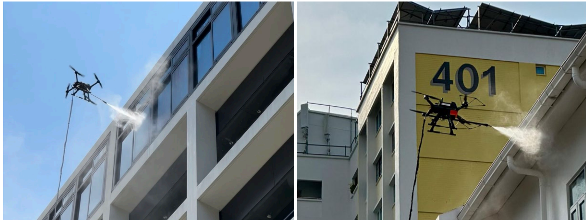
Figure 3: showcasing ALICE in live deployment