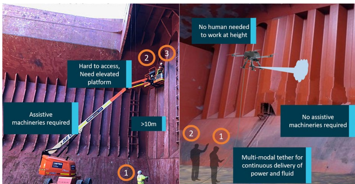
Figure 8: Spinoff's autonomous tethered rotorcraft platform replaces hazardous at-height inspection and cleaning work, delivering continuous power and fluid to the drone via a multi-modal tether.