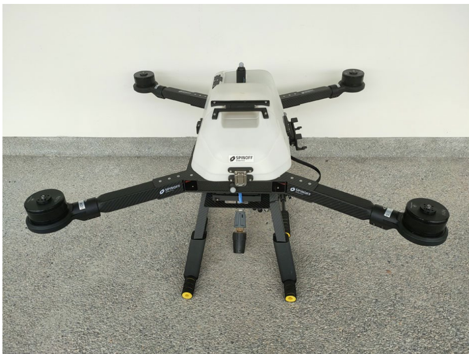
Figure 2: Spinoff-engineered drone with proprietary mechanical and flight control, the foundation on which ECS-DoT silicon, METRON and ALICE combine into Nanoveu's full-stack drone platform.