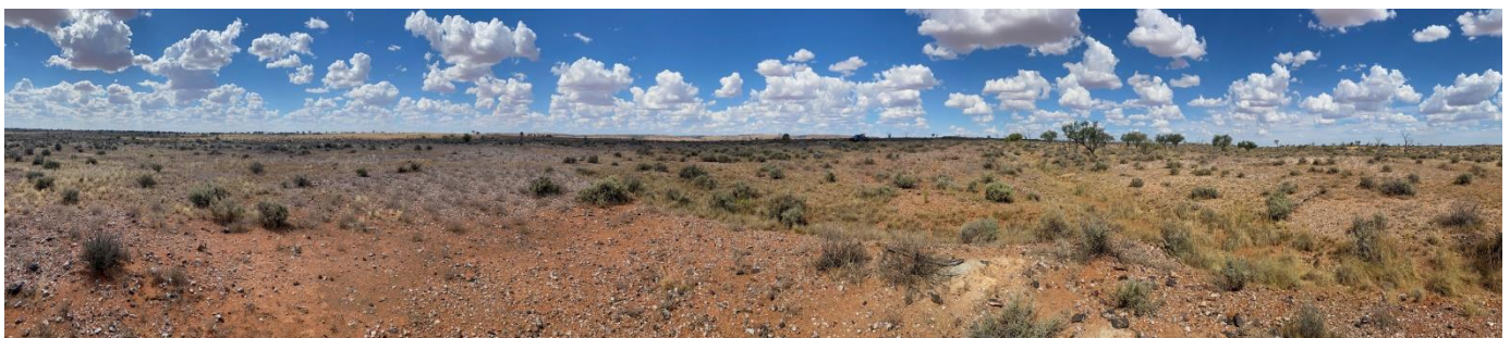
Photo of Wilandra Copper Corridor

Mineralisation is hosted in a semi continuous mineralised zone over a strike length of 4km and defined by 75 drill holes and is open at depth. HeliTEM, soil geochemical anomalies and recent CSAMT geophysics confirm higher magnitude anomalism along strike and in proximity to the known mineralisation, highlighting the potential association with sulphide mineralisation.