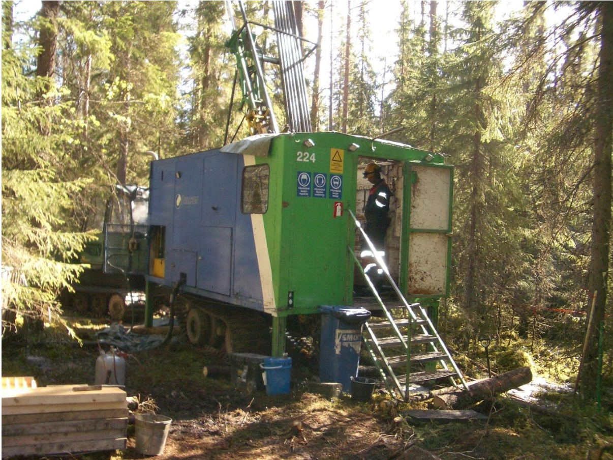
Figure 3: Drill rig on site