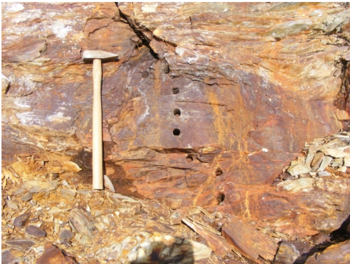
Photo 1: Stratiform massive sulphide layer photographed near one of the VTEM anomalies. Some historic evidence suggests this sub-region of Sulitjelma may be richer in zinc than previous production sites to the west.

these sheets where structural repetition or thickening can make this mineralisation economic.