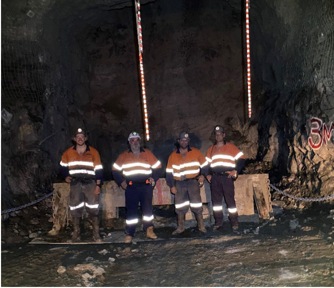
Figure 2: Development breakthrough into FAR #3

This critical development task was completed safely, in-line with budget and ahead of schedule. Barmenco will now focus on advancing the incline from the 1401 level and decline from the 1361 level, opening up additional working levels at Savannah North. These works are planned to be funded from existing cash reserves with the objective of being in a position to restart production operations from mid-2021.