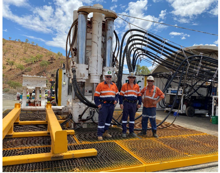
Figure 3: RUC Raisebore rig setting up on surface

Specialist raise boring contractor, RUC Mining, has mobilised to site. RUC is tasked with the FAR #3 back-reaming which is expected to be completed around the end of the March 2021 quarter. A total of 354m will be back reamed at a diameter of 3.85m. This is planned to provide sufficient ventilation to support future full-scale mining operations from Savannah North in line with the Mine Plan released in late July (refer to ASX announcement 31 July 2020). Completion of FAR #3 is also set to be funded from existing cash reserves.