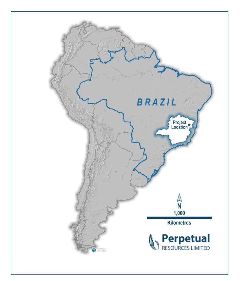
Figure 1 – Location of the prospects under Option in the prolific region of Minas Gerais, Brazil.

We also are forging a close working relationship with the permit vendor group and several other incountry specialists, which gives Perpetual significant capacity to quickly assess these compelling exploration ground positions and ultimately quickly add value through exploration activities".