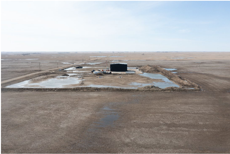
Figure 3: Aerial view of the facility during construction