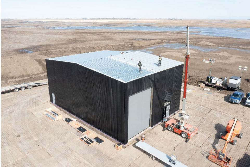
Figure 1: Aerial view of the facility during construction

Link to video of construction work is here: Prairie Lithium Facility Construction - Roof