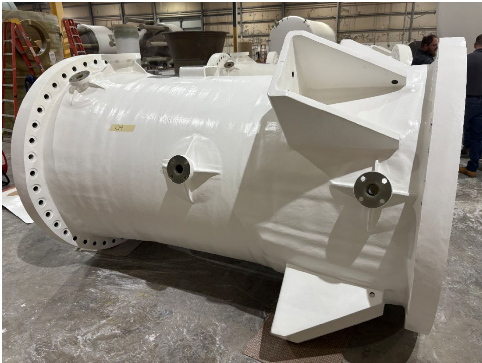
Figure 5: Construction of Li-Pro DLE Columns