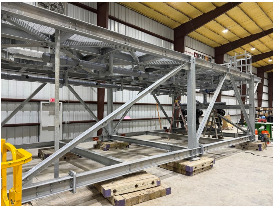
Figure 4: Construction of Li-Pro DLE Structure

This scalable model provides a clear pathway from initial production to meaningful long term supply growth.