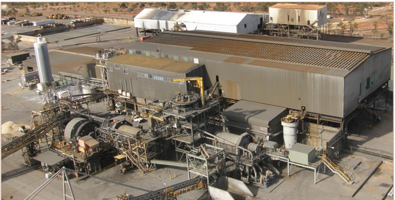
Figure 1: Endeavor Mine Processing Plant