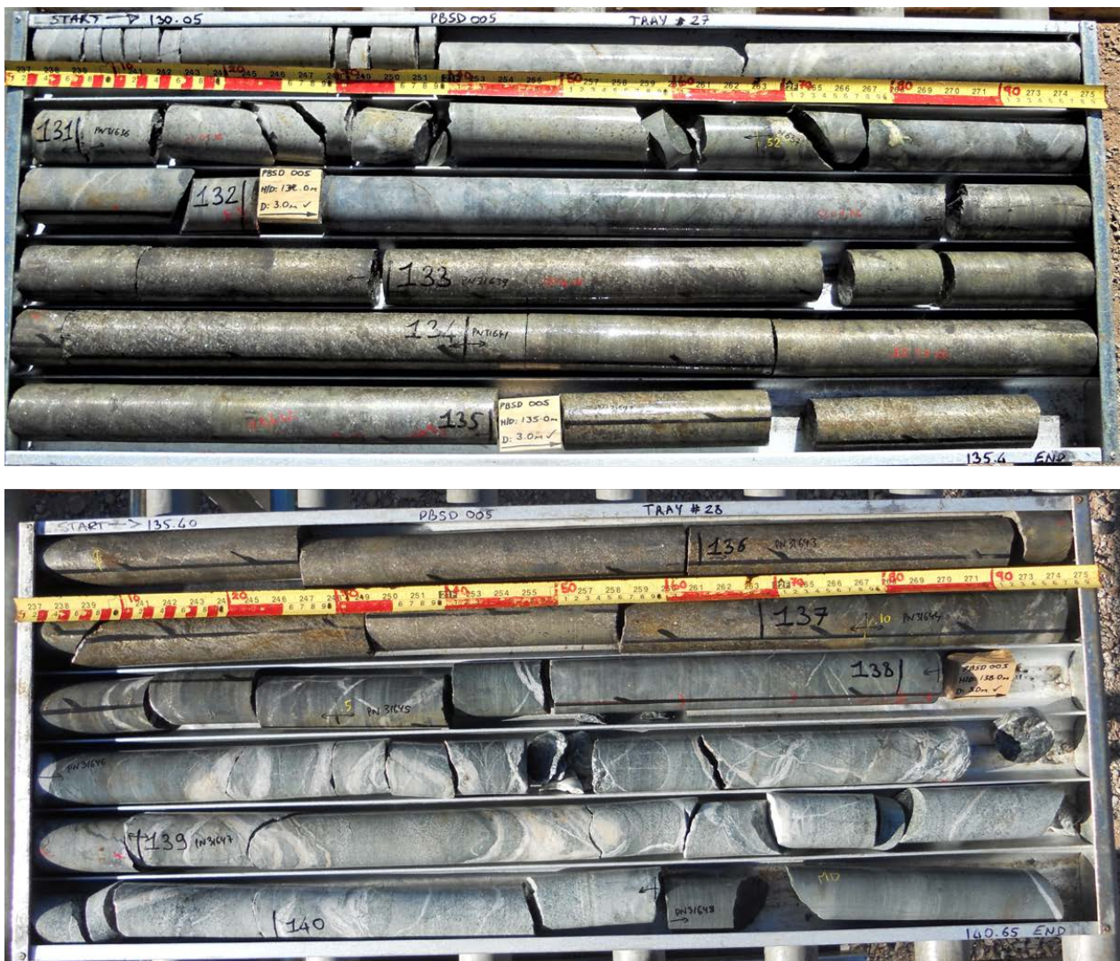
Figure 1: Core from PBSD005 (Tray 27 &28) showing massive sulphide mineralisation

The Silver Swan program is aimed to extend the size of the Silver Swan deposit and, in addition, confirm the veracity of inferred resources for later conversion to the indicated category prior to mining.