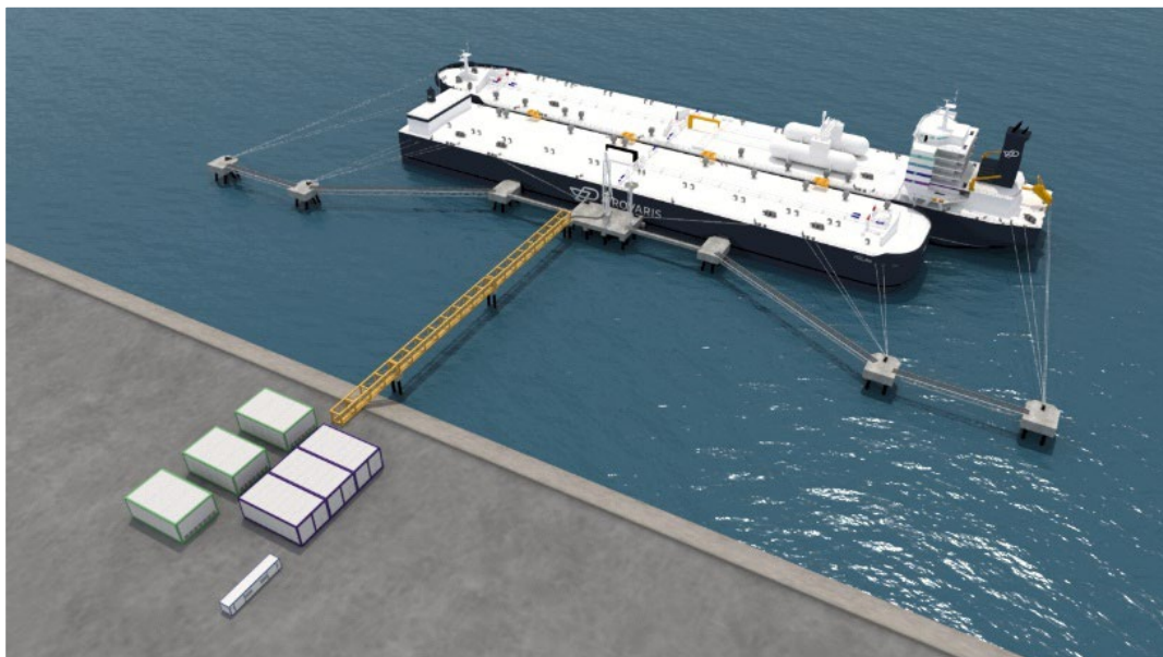
Figure 2: Illustration of a Provaris' H2Neo Carrier and conceptual Compressed H2 Floating Storage solution suitable for export and import use cases.

With many pilot projects well under way, availability of low-cost renewable energy (largely from wind and hydro-power), and a Government highly supportive of initiatives to develop technologies, projects and to scale up hydrogen production and exports, Norway has numerous project sites that can be developed for large scale exports commencing in 2027 to off-takers in the EU.