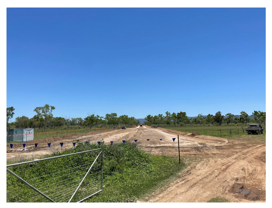
Figure: View looking north towards Jones Rd from QPM northern boundary – access road construction