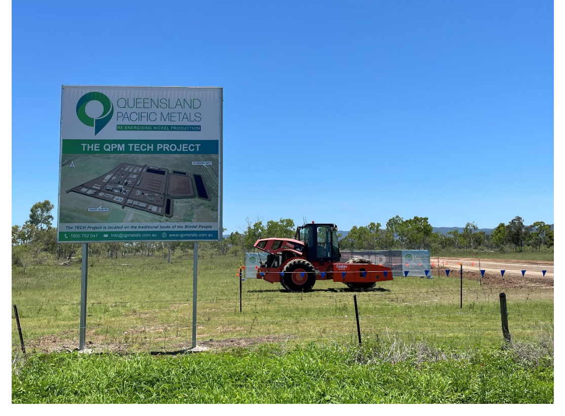
Figure: QPM site at Lansdown